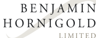
Benjamin Hornigold Ltd ASX: BHD

ABB operates as a national carrier of telecommunications and technology services in Australia, servicing residential, business, wholesale, and enterprise and government customers.