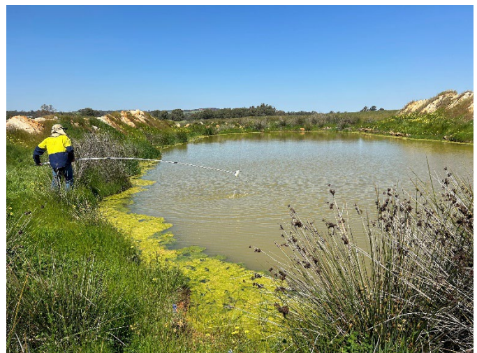
Figure 2 and 3: Winter season water feature sampling collection as part of a bi-annual sampling program.