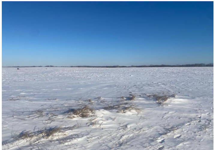
Figure 1: Typical conditions within Project area as of Feb 13th, 2025

In anticipation of the start of drilling, Murfin Drilling Company Ltd will move the rig to a closer laydown yard to commence pre-drilling rig upgrades and safety inspections.