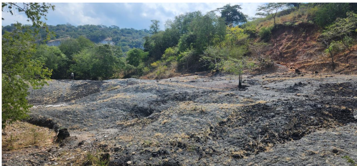
Figure 4: Surficial supergene manganese at the Sica Prospect, photo taken looking north from Sica Prospect symbol location in Figure 3.