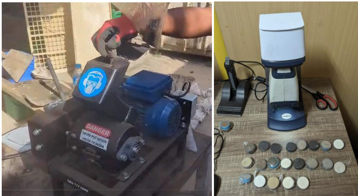
Figure 5: Crusher / Pulverisor and pXRF analysis system set up at Estrella's office in Dili with samples ready.