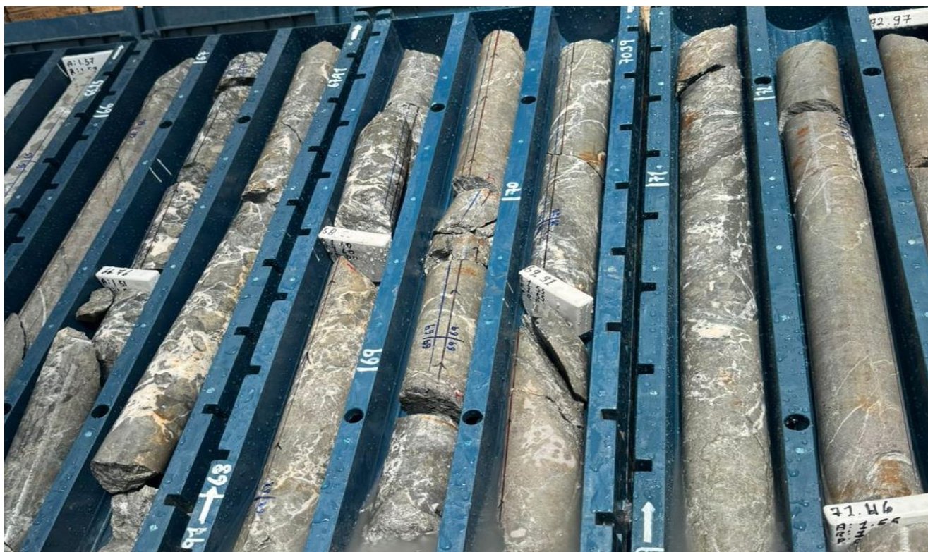
Plate 1: Hole IGDD24-037 diamond core from Iguana east prospect, Dynasty Gold Project. The photo displays a 5.1m wide mineralised hydrothermal breccia zone with argillic alteration intersected from 66.3 to 71.4m depth. The zone exhibits stockwork veining comprising ~10-30cm wide massive quartz-carbonate veinlets and disseminated sulphide minerals including pyrite (<0.1-1.2%), marcasite (0.5-1.0%) and arsenopyrite (0.5-1.2%). Assay results for IGDD24-037 expected late January 2025.