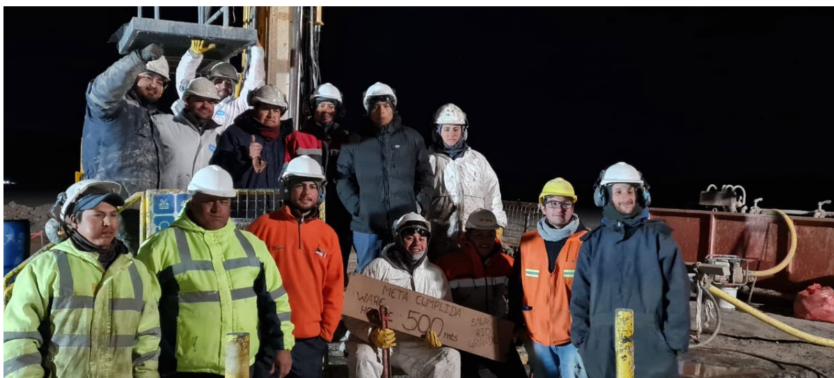
Figure 2 – Pursuit’s on-site drilling team following completion of DDH-2 to a depth of 500m

Following completion of DDH-2, Pursuit is currently awaiting environmental approvals to commence drilling at DDH-3 which is to be relocated to the Mito tenement in the north section of Rio Grande. Pursuit is targeting a material resource upgrade in 2024, which will build on the recent maiden resource defined at the Rio Grande Sur Project. 1 The adjustment of DDH-3 from the southern section to the northern section is focused on maximising this resource upgrade target, with intercepts of ~900mg/l Li obtained from an adjacent project some ~2km to the east of the proposed location of DDH-3.