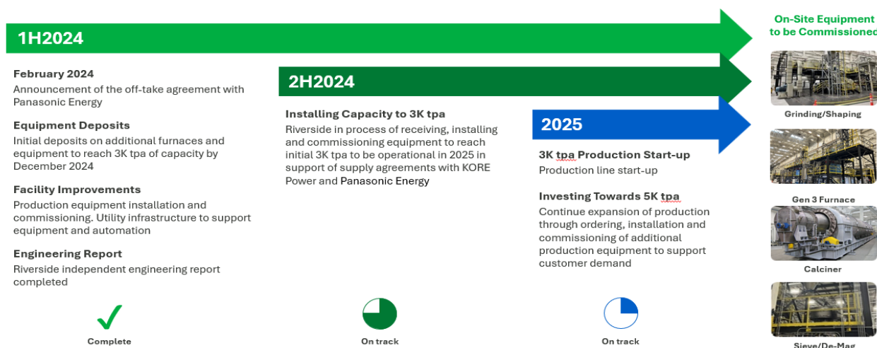
Figure 3 Path to commercial production at Riverside