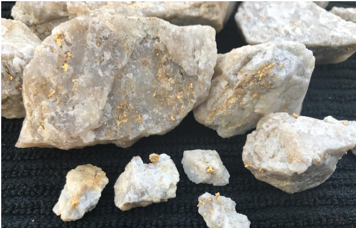
Figure 2: Example of visible gold in rock samples taken from around the Lady Ada deposit (see announcement dated 12 Sept 2017)