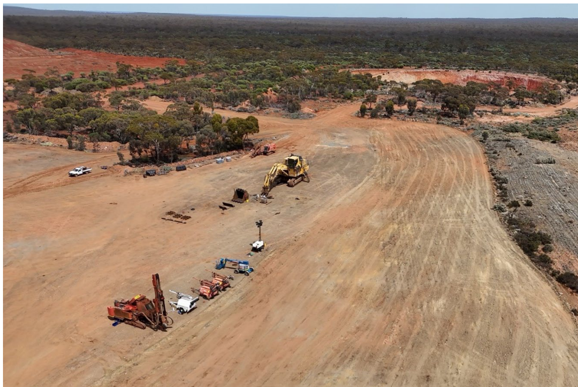
Figure 2: Aerial view of initial clearing and equipment mobilised to Phillips Find