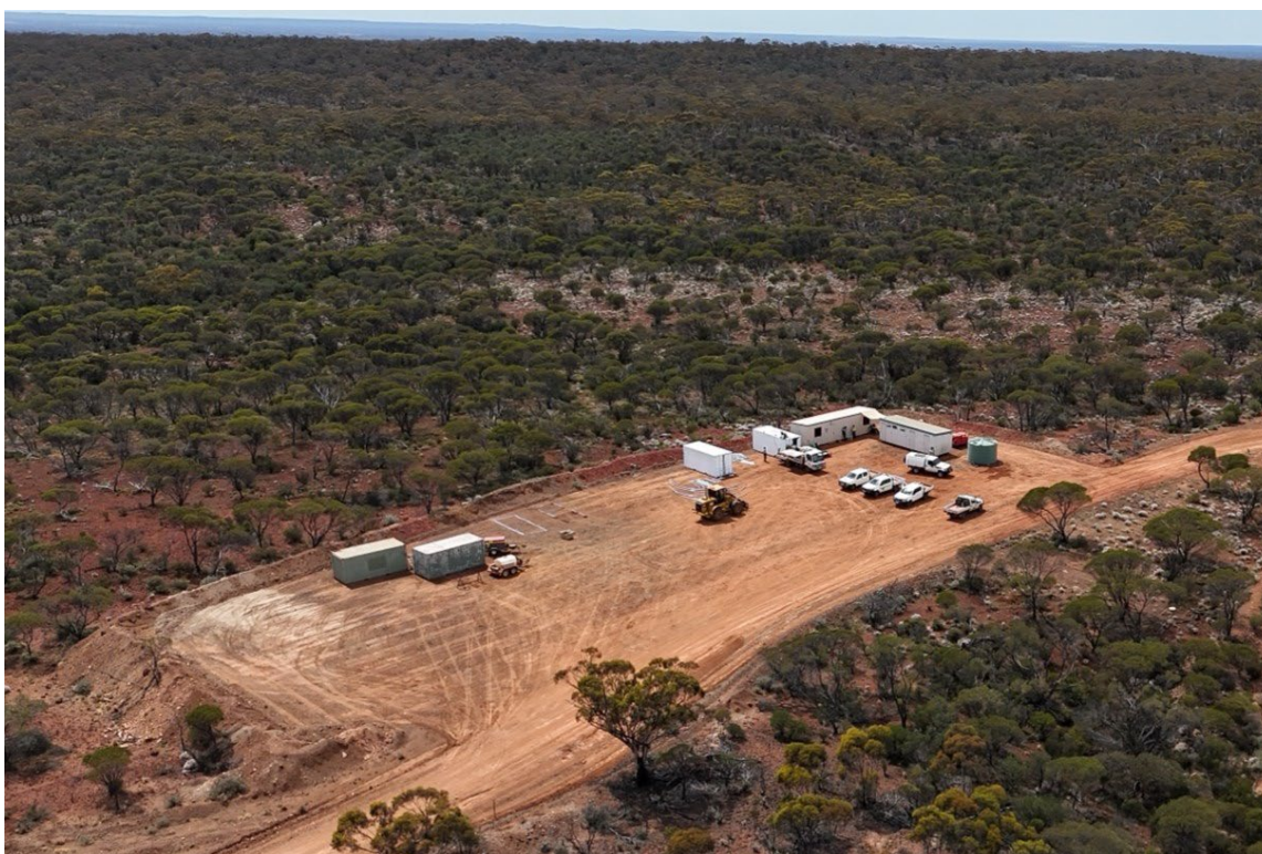
Figure 4: Aerial view of clearing and establishment of offices and workshop area