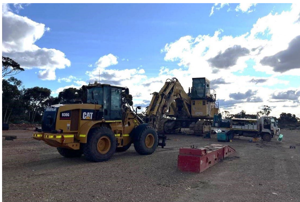
Figure 3: Reassembling the PC2000 excavator on site following transport