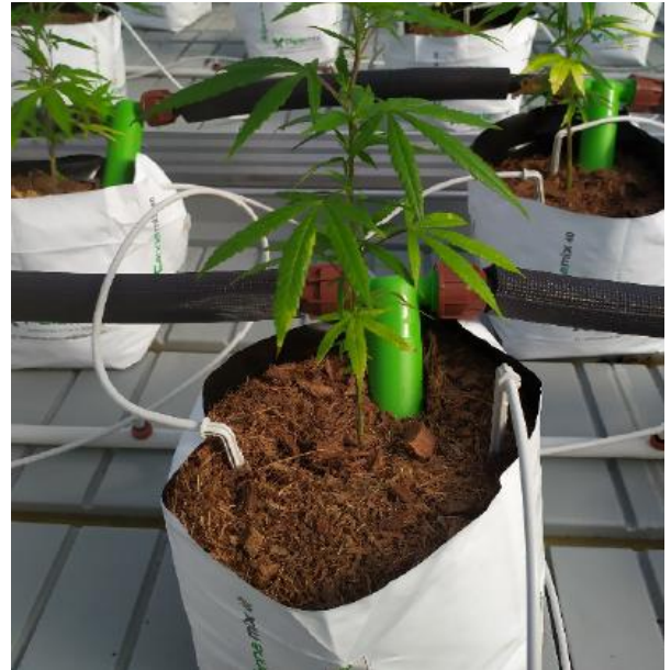
Images 1 & 2: Heat Exchange Probe deployed into pots (left) and grow bags (right) maintaining optimal root zone temperature