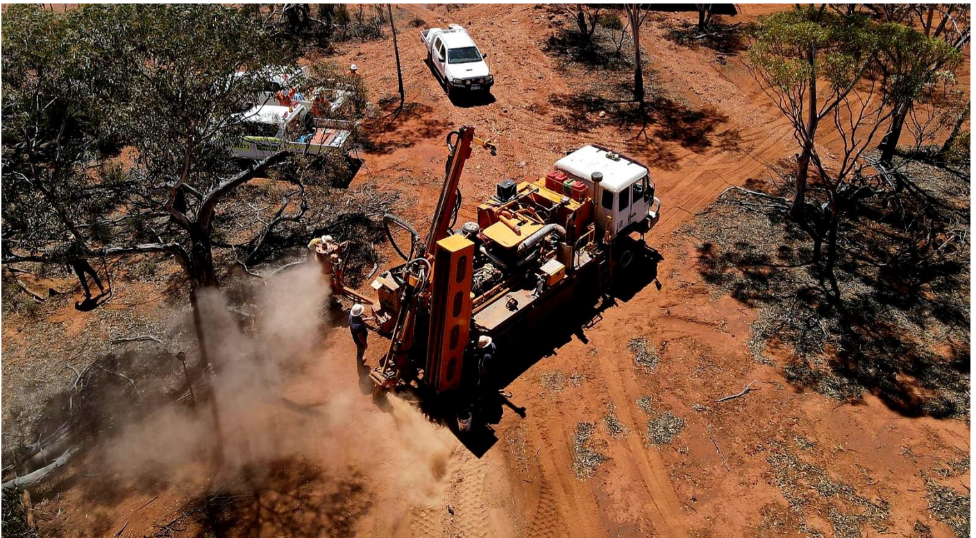
Figure 1 - KTE Mining Services air-core drill rig commencing drill programme at the Kemble gold prospect.

Maximus Resources Limited ('Maximus' or the 'Company', ASX:MXR) is pleased to advise the commencement of a multi-target air-core drill programme at its Spargoville Project, located 25km from BHP's Nickel Concentrator in the world-class Kambalda district, Western Australia.