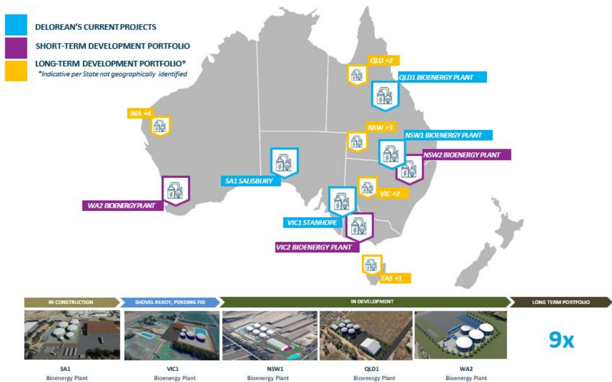
Projected Biomethane Production from Delorean Bioenergy Projects

Delorean’s projects replace natural gas with biomethane, driving decarbonisation in hard-to-abate sectors through existing infrastructure.