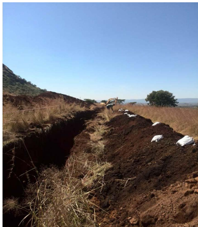
Fig 2: Trench sampling at Longonjo Rare Earth Project