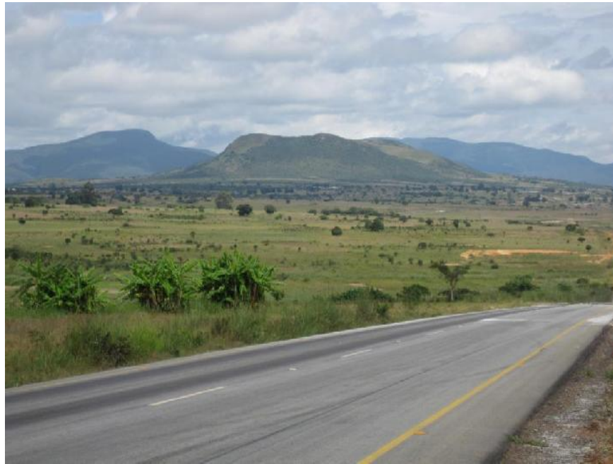
Figure 1: Longonjo Carbonatite vent, looking west from National highway