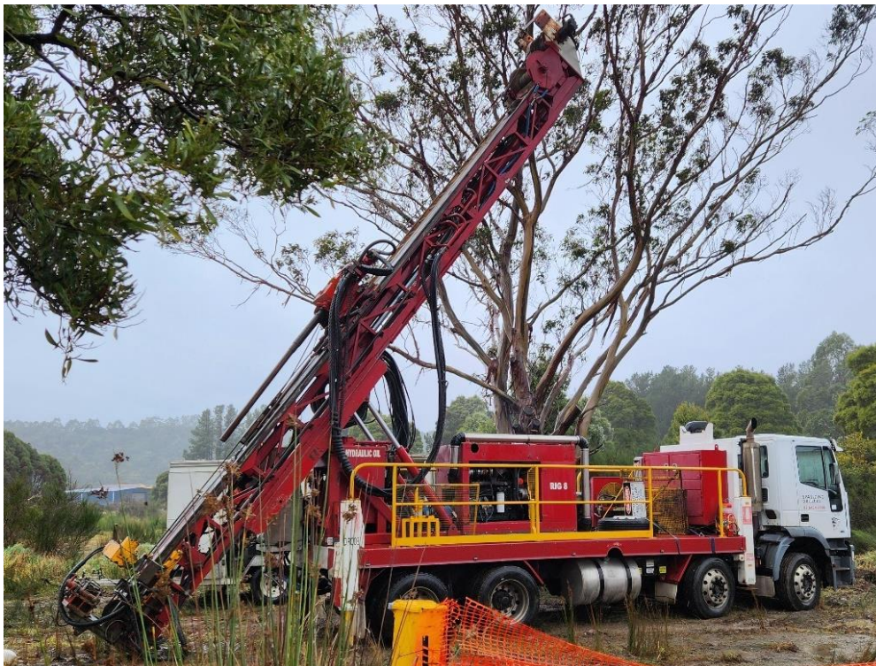
Figure 3 – Diamond Drill Rig at the Severn Deposit