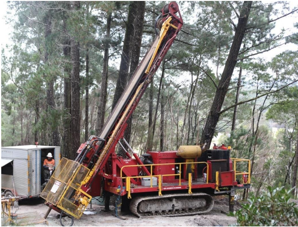
Figure 2 – Diamond Drill Rig at the Queen Hill Deposit