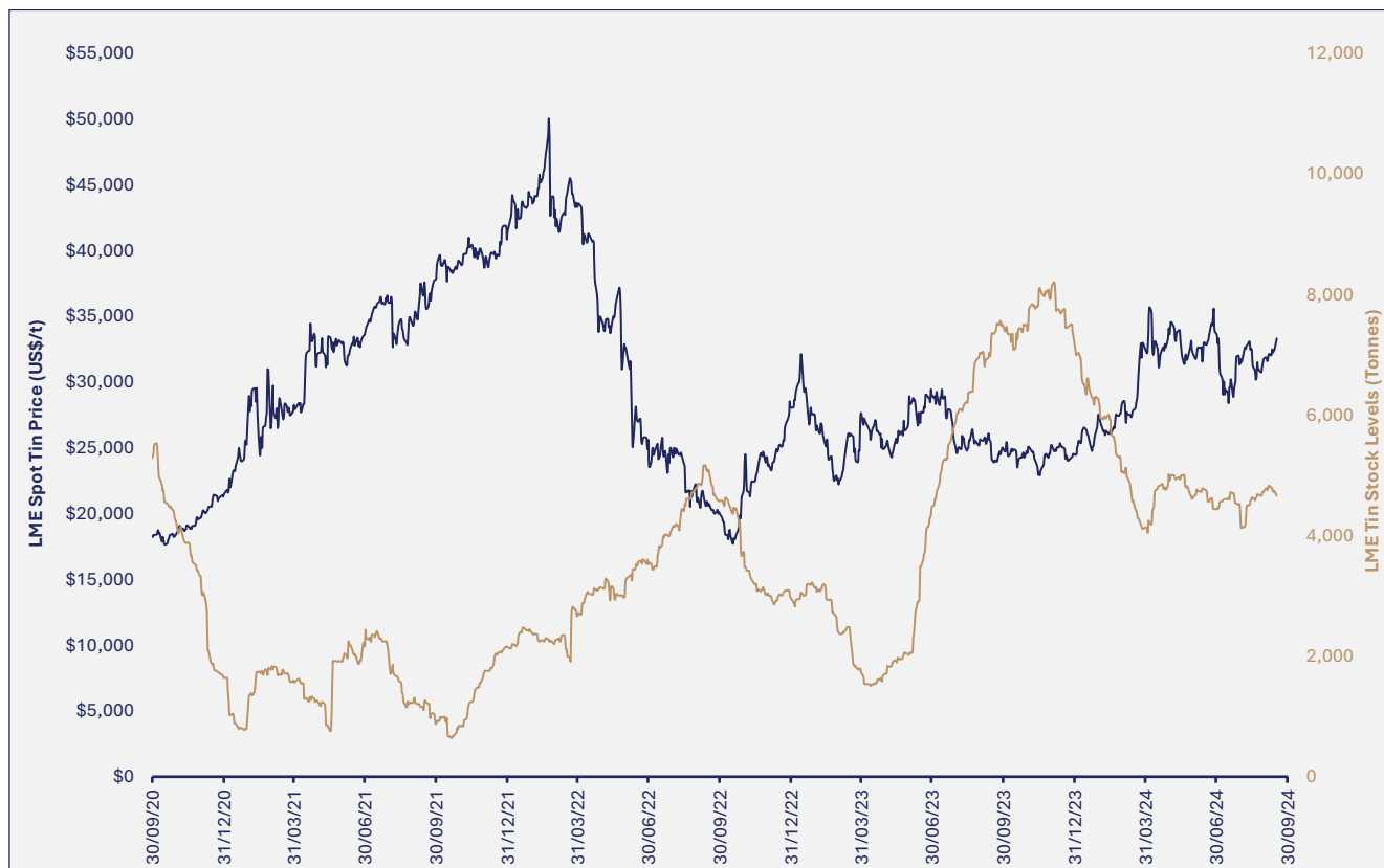
Figure 1 – LME Spot Tin Price and Stock Levels 01/10/20 to 30/09/24

Stellar Resources Limited (ASX: SRZ, “Stellar” or the “Company”) is pleased to present its quarterly activities report for the period ended 30 September 2024 (“ September Quarter ”). A key achievement announced in the quarter was the completion of the updated Heemskirk Tin Scoping Study incorporating the 2023 Mineral Resource Estimate (MRE) 5 , which demonstrates robust base case economics and supports our strategy to complete a PFS.