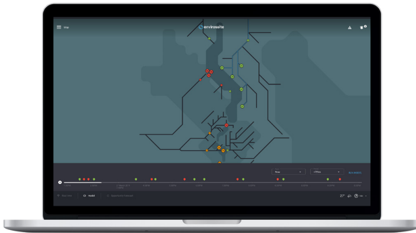
Above: Concept for how SeweX may be visualised in the EnviroSuite user interface.

Further to the information contained in this announcement and in accordance with ASX Guidance Note 8 to listing rules 3.1-3.1B the Company advises that: