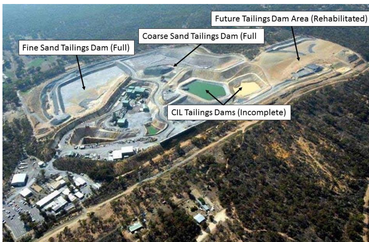
Figure 1: Kangaroo Flat Tailings Dams

In summary, the plant is too large for the gold deposit, there is no tailings capacity available and no opportunity to construct a new tailings facility. Maximising the value of the gold processing plant at Kangaroo Flat has been a priority for GBM.