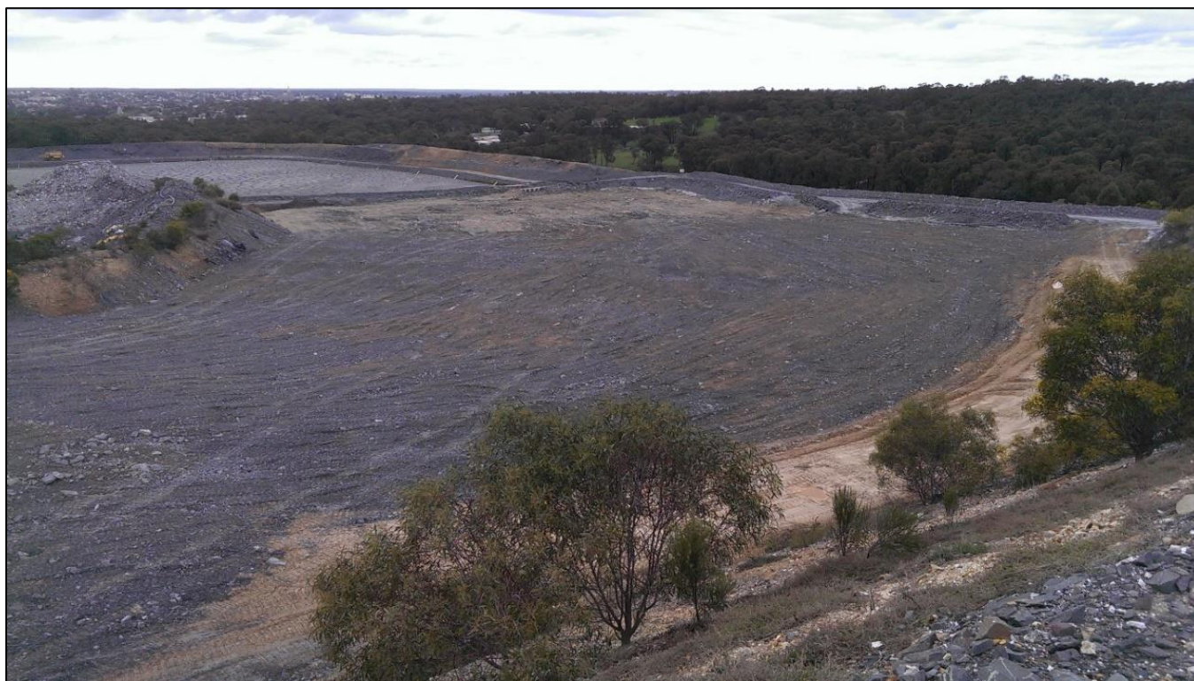
Figure 2: Coarse Sand Dam – 430,000 tonnes of sand

The sand dam is estimated to contain a mineral resource of 430,000 tonnes of material containing 5,100 ounces of gold at a grade of 0.37 g/t. 320,000 tonnes of material containing 3,900 ounces of gold have been classified as Indicated with a further 110,000 tonnes containing 1,200 ounces of gold have been classified as Inferred.