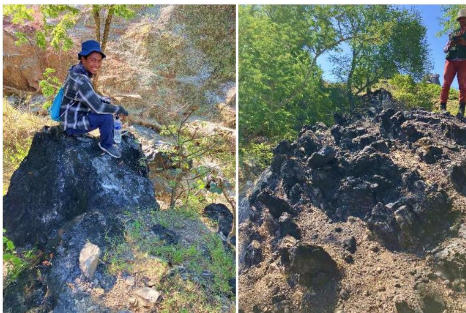
Figure 4: Estrella Geologists on outcropping manganese supergene at the Samalari Mn Prospect where surface mineralisation contains between 60% and 85% Manganese Oxides and Hydroxides. 5

In September, Estrella announced that following the award of the Baucau concessions the Company immediately identified a high-grade manganese discovery named the Samalari manganese prospect 5 .