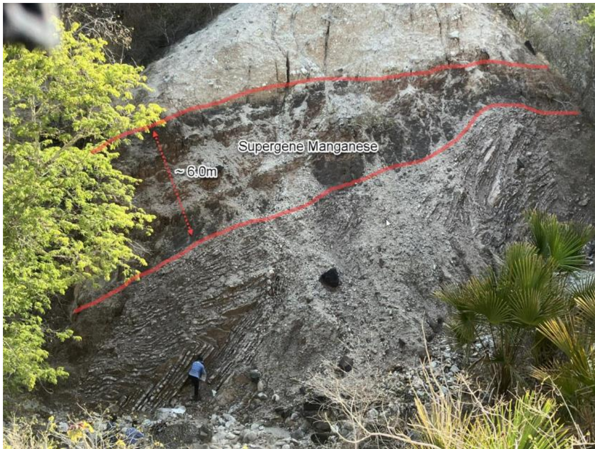
Figure 6: Estrella Geologist Kharol Varela mapping and sampling chert bedding below supergene development in an exposed outcrop 500m south-west of the Samalari discovery area within concession MEL2024-DA-ZB-001. Visual estimates of the mineral abundances present within the exposure is not possible for safety reasons. 6

The mineralisation in the pictured outcrop has not yet been sampled given difficult access to the location and with the outcrop exposed around 8m up a steep gully face.