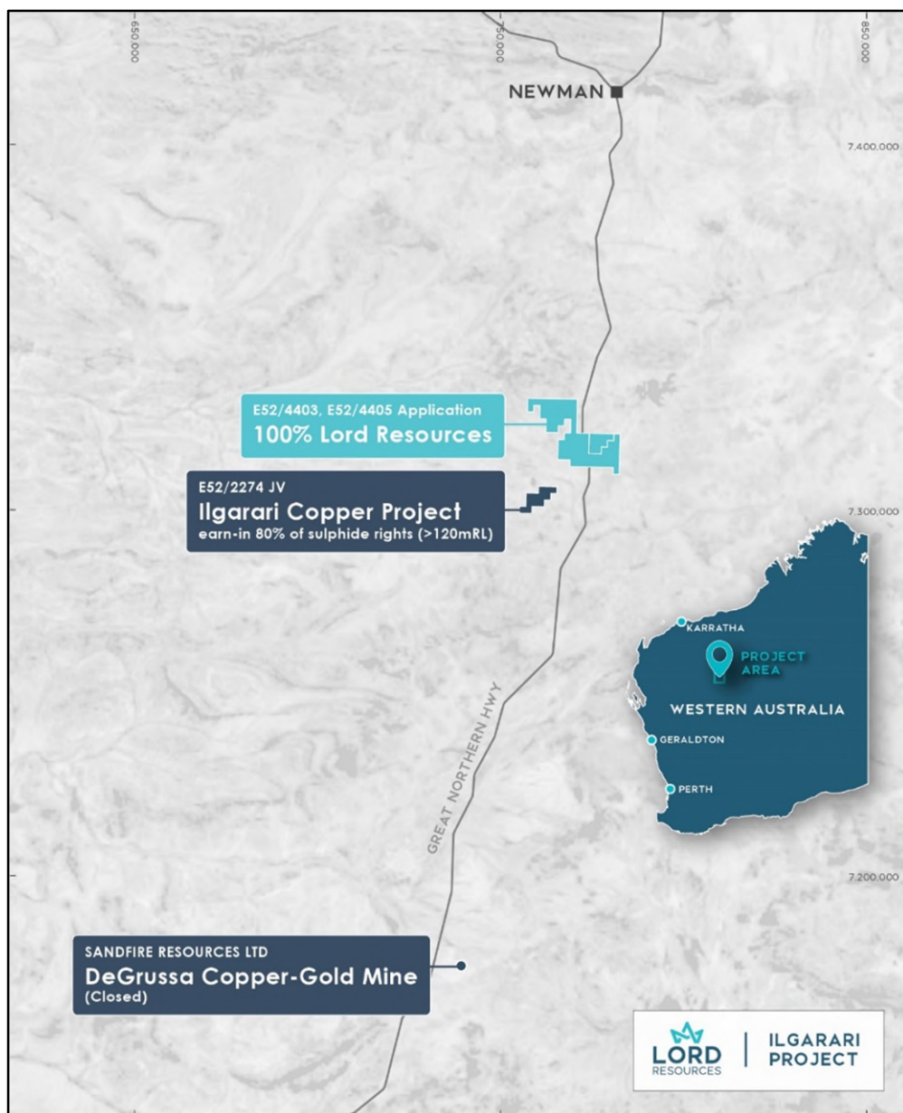
Figure 3: Ilgarari Copper Project location plan.