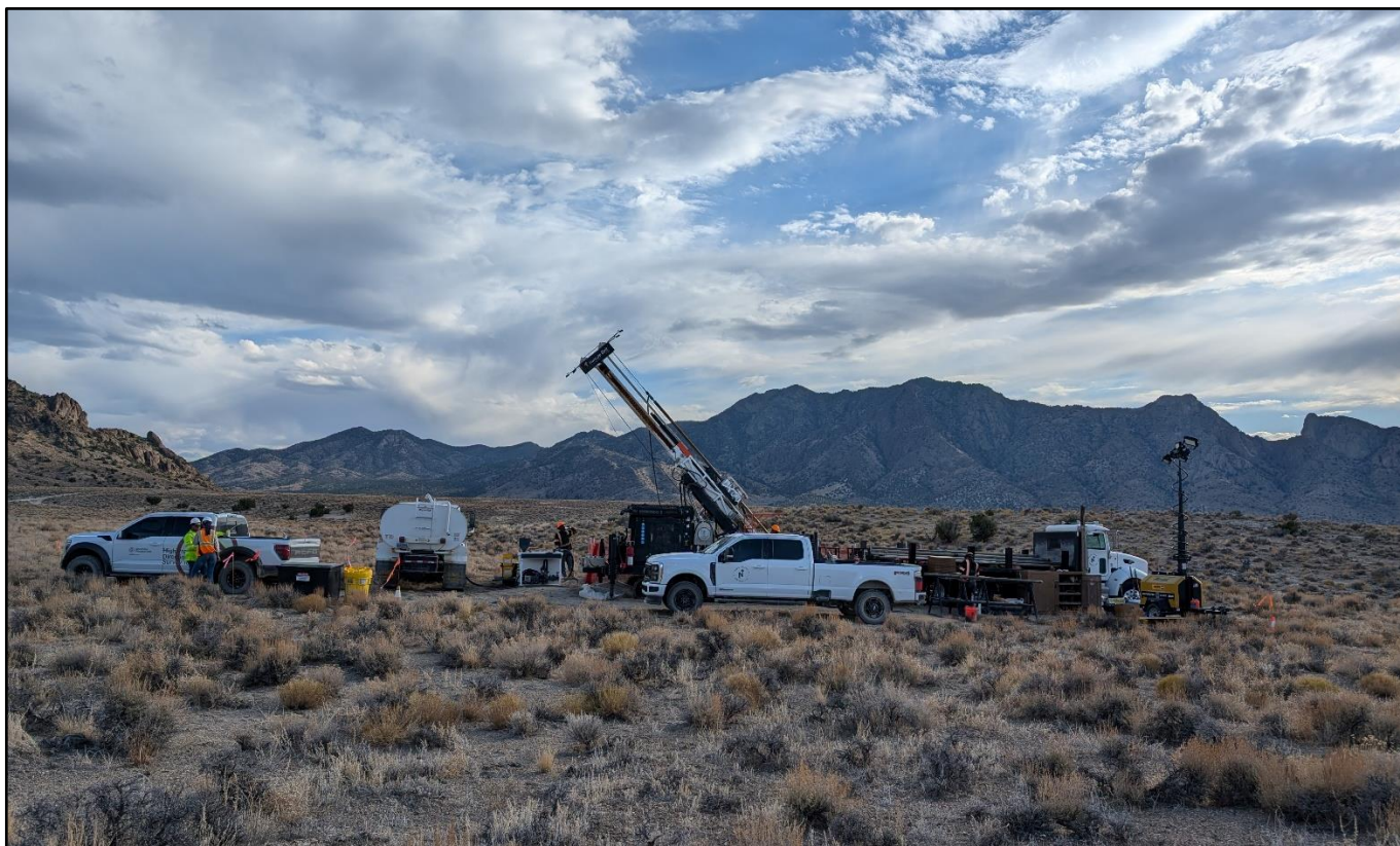
Figure 1. True North diamond drill rig set up at site RMS024.

Other attractive Project characteristics include close proximity to infrastructure, with the Project being immediately adjacent to the Grand Army of the Republic Highway (Route 6), which links the regional cities of Ely with Tonopah.