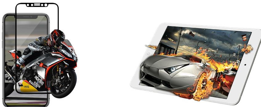
Figure 1: Nanoveu's Eyefly3d Films enable glasses-free 3D viewing on phones, tablets and large format displays

Nanoveu has granted Rahum Nanotech exclusive distribution rights in South Korea for Nanoveu's EyeFly3D™ Products, for an initial exclusive period up to 31 December 2026, subject to Rahum Nanotech meeting minimum purchase order targets as outlined below.