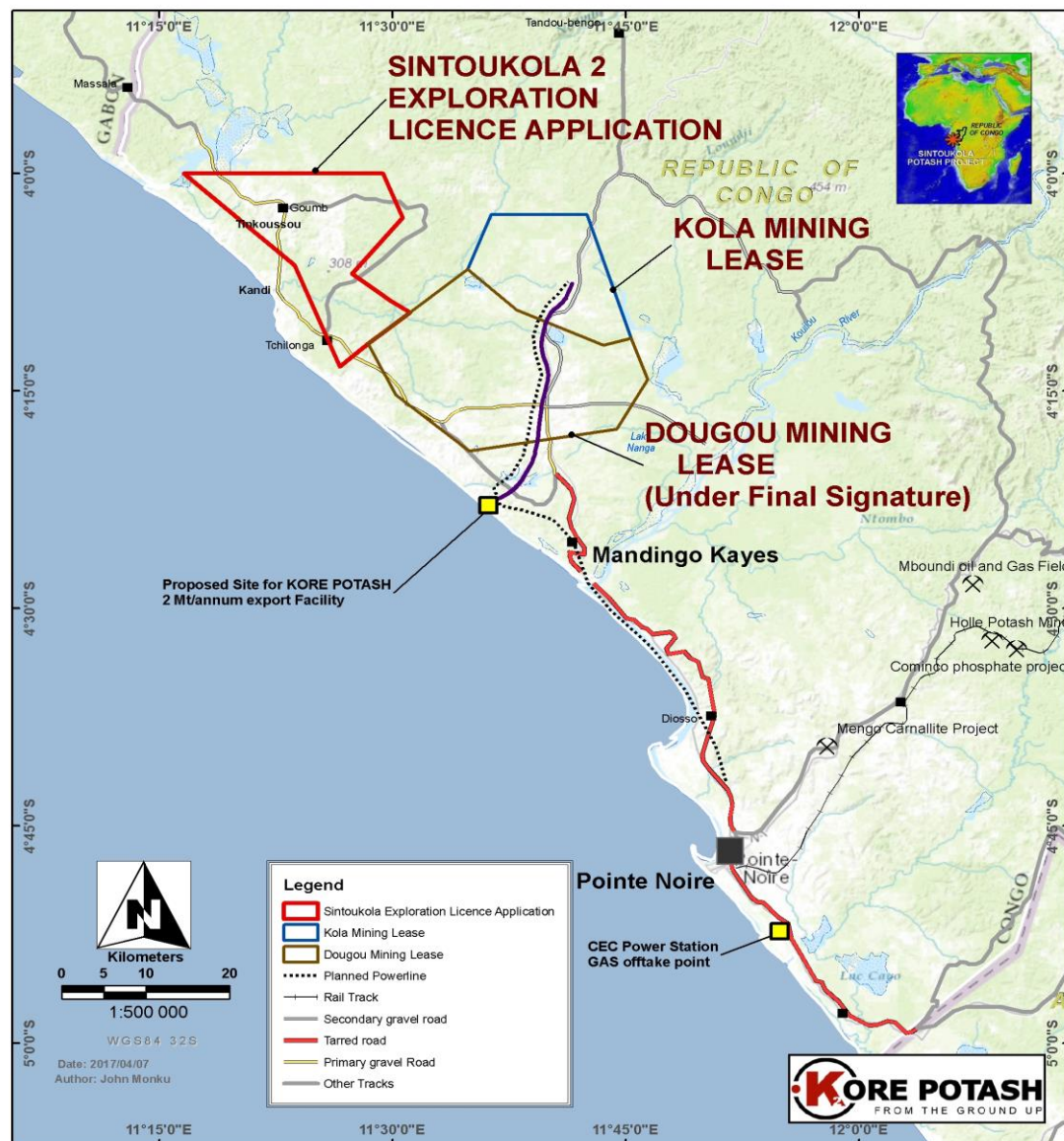
Figure 1. Map showing the location of the new Sintoukola 2 Exploration License application