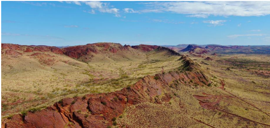
Figure 2: Paulsens East Hematite Ridge

Paulsens East consists of a three-kilometre-long outcropping high-grade hematite ridge (refer Figure 2), containing a JORC Indicated Mineral Resource of 9.6 Million tonnes at 61.1% Fe , 6.0% SiO 2 , 3.6% Al 2 O 3 , 0.08% P (at a cut-off grade of 58% Fe). 3