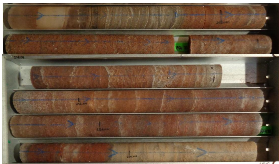
Figure 1. The Hangingwall seam sylvinite in EK_49 (orange-pink colour). 4.04 metres grading 58.9% KCl. Rock-salt above and below the seam is included in the photograph