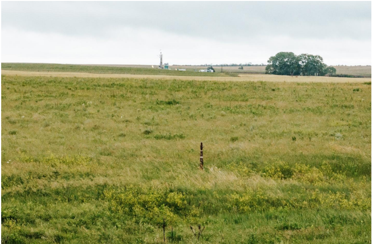
Figure 1: Blythe 13-20 (background) well site is located around 1,400m east of the historic Scott-1 well (foreground) drilled in 1982.

The Company is pleased to announce that Blythe 13-20 was drilled to a total depth of 5,300ft mDKB (1,615m) on time, on budget, with no HSE incidents. The well drilled through approximately 3,028ft (923m) of sedimentary rocks and 2,272ft (692m) of Pre-Cambrian basement. Blythe 13-20 well was drilled into a new geological play in the Company's acreage. The Blythe 13-20 well site is located around 1,400m east of the historic Scott-1 well drilled in 1982, which reported hydrogen concentrations of up to 56% in the sedimentary section 1 . The drilling depth reached was 3,100 ft (945m) mDKB deeper than Scott-1 well. The Company has 6,860 net acres in close vicinity to the well site.