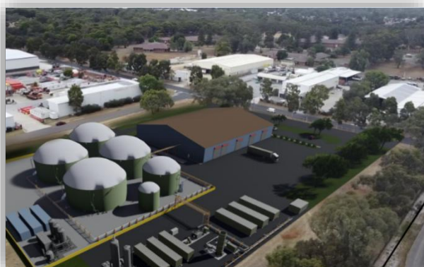
Image 7: SA1 Bioenergy Plant Render Image 8-9: SA1 Bioenergy Project Site

In December 2024, the Delorean Board reached Financial Investment Decision to proceed with the construction of Delorean's SA1 bioenergy project in Edinburgh Parks, South Australia. Procurement of all long lead items has progressed, and site works have begun.