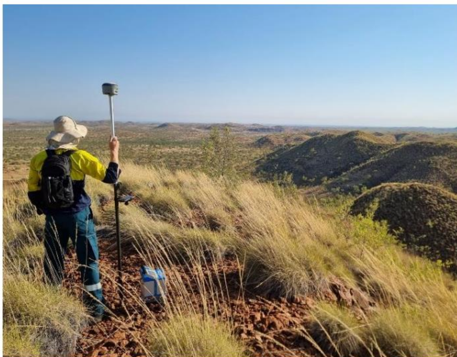
Figure 3 | Gravity surveyor standing on the northern boundary of Panton looking north-east

It is expected that these surveys will generate new anomalies that will warrant drill testing. The Company is being supported by Terra Resources and Southern Geoscience Consultants on its geophysical programs.