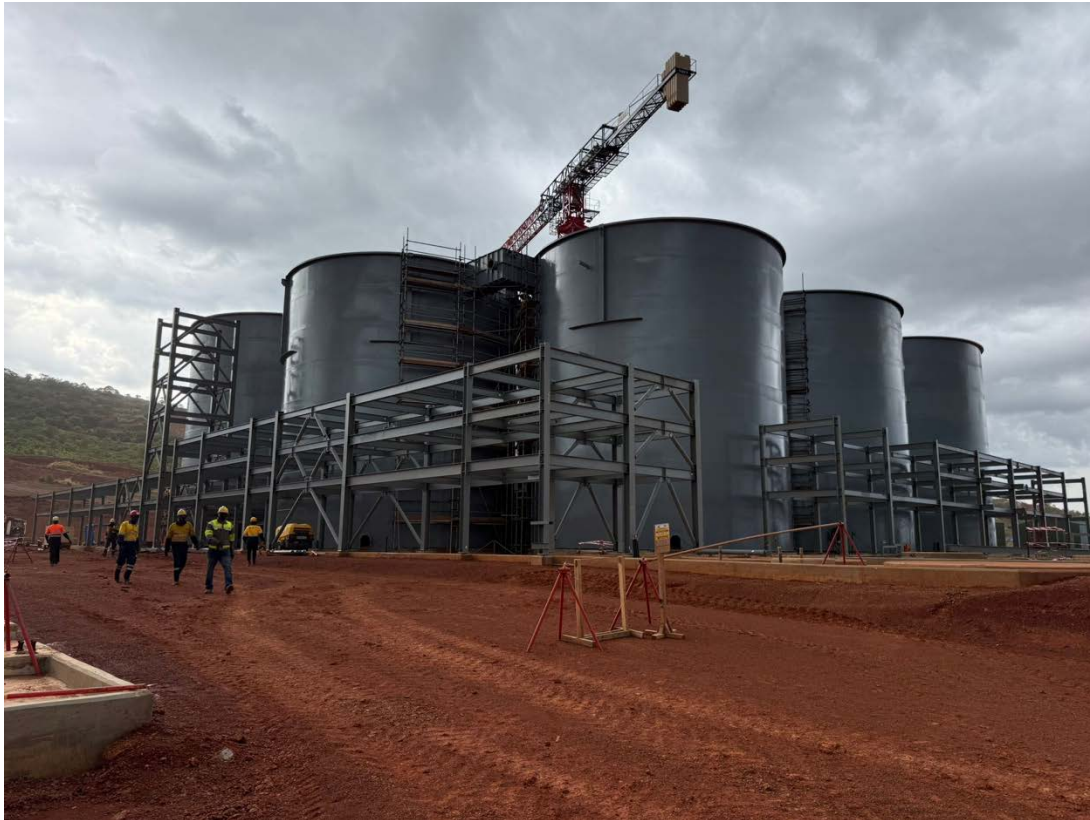
Figure 3: View of CIL with main pipe rack steel erection of steel (11 June 2025)