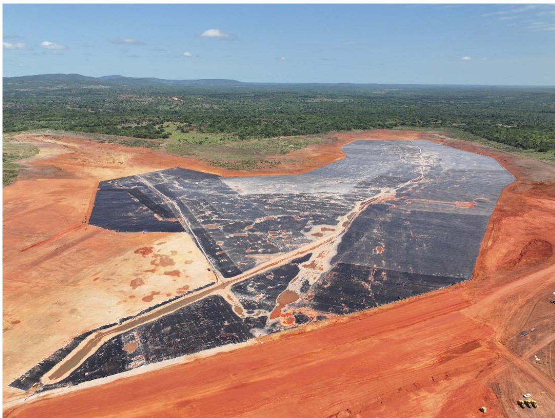
Figure 4: Tailings storage facility showing the extent of lining and main embankment construction (7 June 2025).