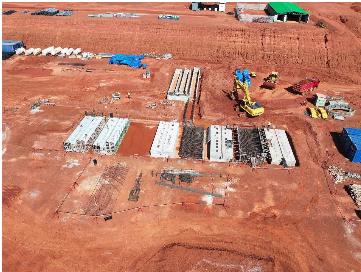
Figure 8: Five out of eight power station generator bases have been poured (7 Jun 2025)