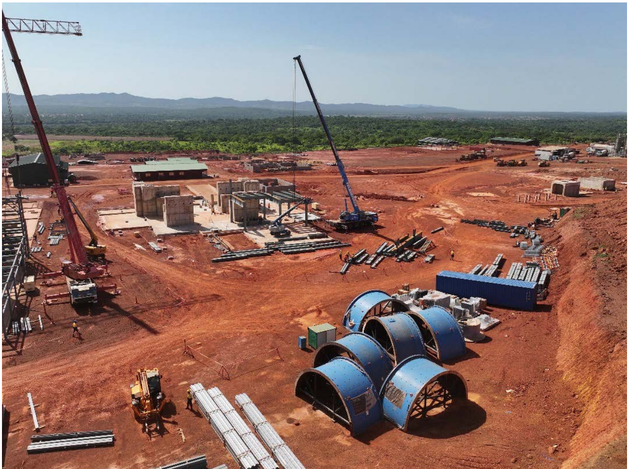
Figure 2: View of Milling building showing erection of steel (7 June 2025)