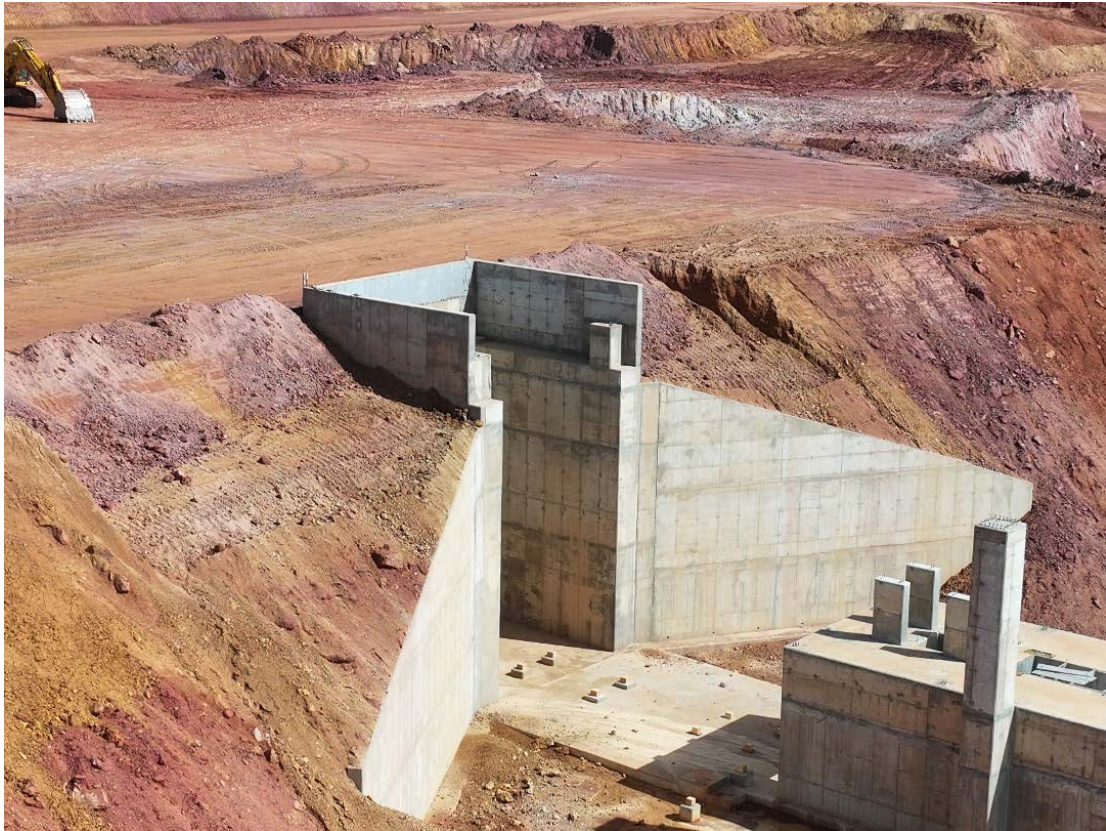
Figure 6: Primary crusher ROM pad and chamber (7 June 2025)