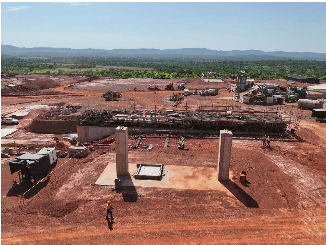
Figure 7: View of reclaim chamber (7 June 2025)