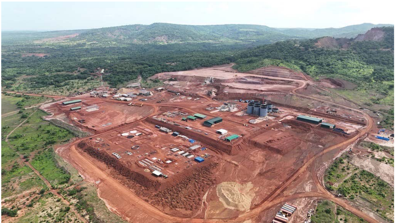
Figure 1: Aerial view of the Kiniero site showing process plant and infrastructure (9 June 2025)