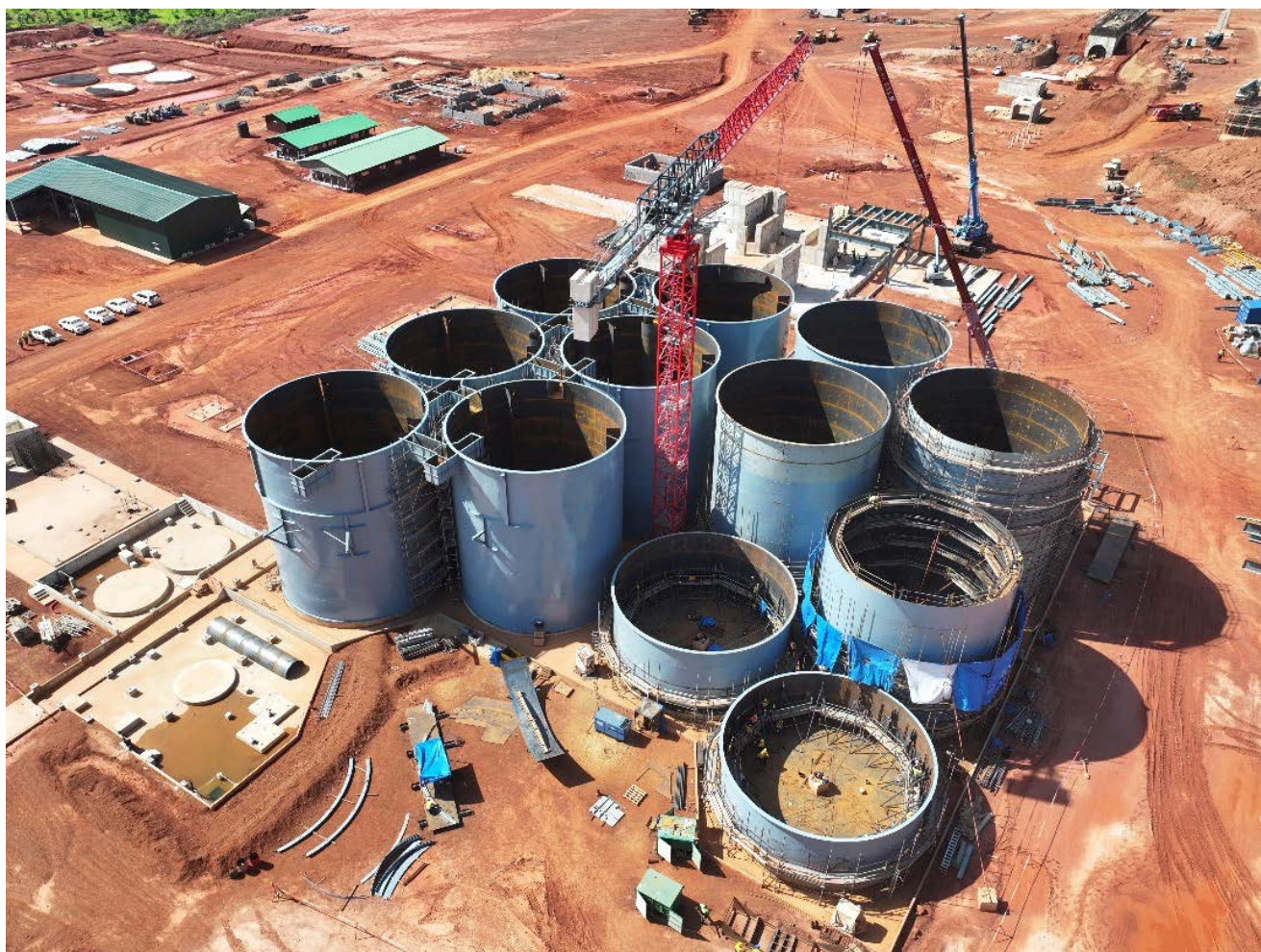
Figure 5: View of the Milling and CIL looking west (7 June 2025)