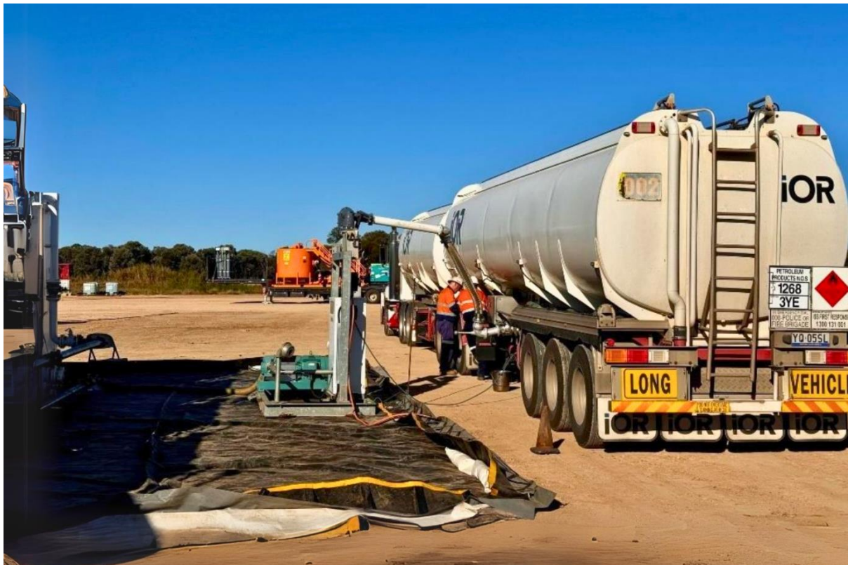
Figure 3: Tanker being loaded with oil from the Canyon-1H well for transport to refinery

Key milestones in 2H25 include an expanded well program, seismic acquisition and advancing strategic discussions with several potential Tier-1 international and domestic partners.