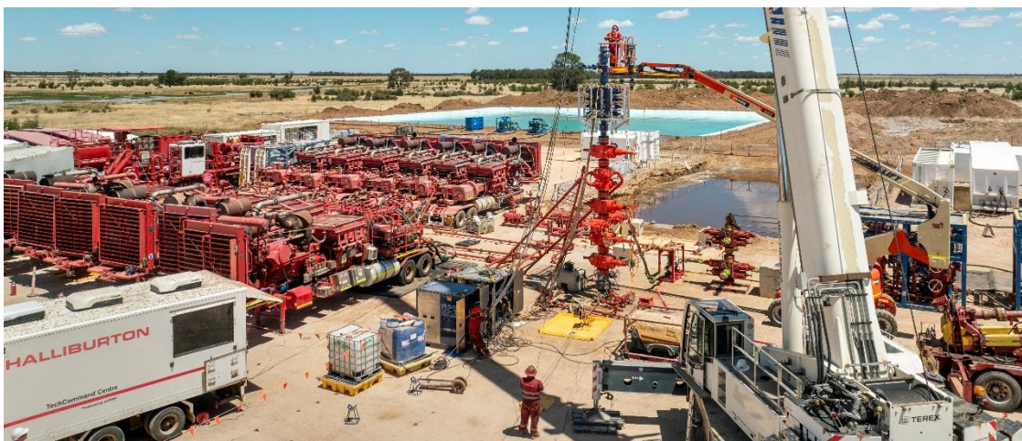
Figure 1: Canyon-1H fracture stimulation test