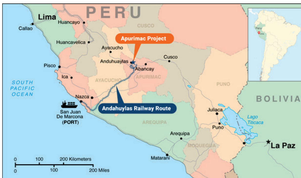
Figure 4: Strike Apurimac Iron Ore Project, showing route of proposed Andahuaylas Railway

In addition to the current JORC resource, there is significant exploration potential given the deposits are open at depth and along strike (with very promising drill results including 154m @ 62% Fe) with extensive undrilled gravity and magnetic anomalies.