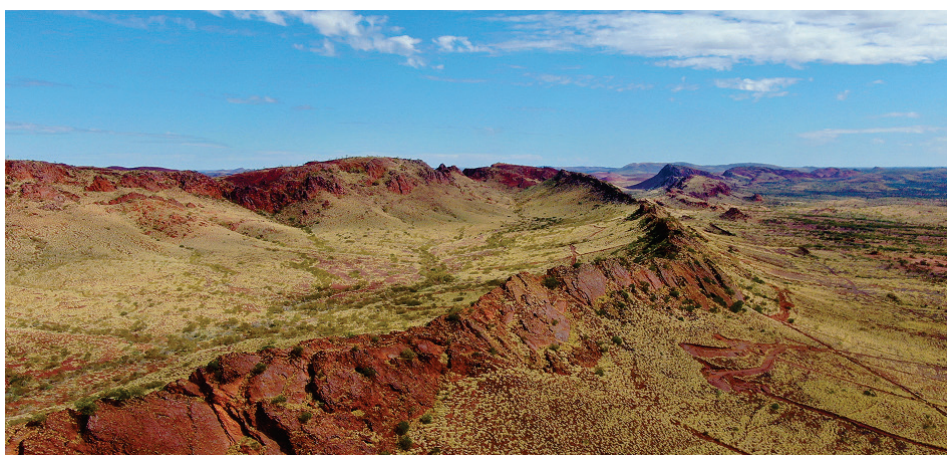
Figure 3: Paulsens East Hematite Ridge

Paulsens East consists of a three-kilometre-long outcropping high-grade hematite ridge (refer Figure 3), containing a JORC Indicated Mineral Resource of 9.6 Million tonnes at 61.1% Fe , 6.0% SiO 2 , 3.6% Al 2 O 3 , 0.08% P (at a cut-off grade of 58% Fe). 4