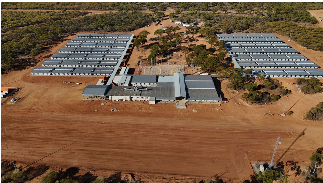
Mt Gibson Gold Project – accommodation village installation

Installation of the 400-room accommodation village for operations has been completed and handed over for the upcoming construction phase. To date Capricorn has spent $34.5 million on these early construction works (budgeted in the $260 million infrastructure cost component of the MGGP development capital).