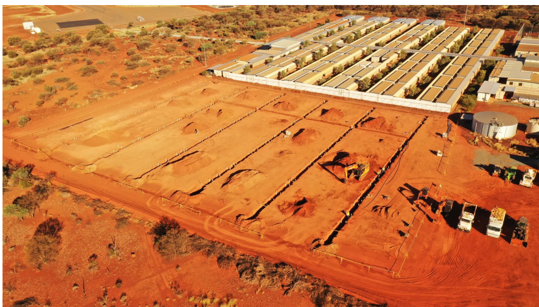
Karlawinda Expansion Project – camp expansion