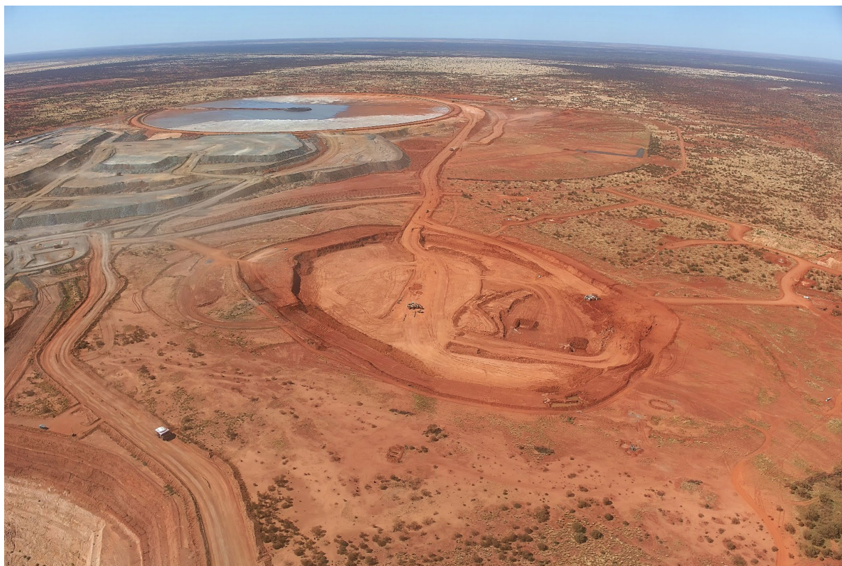
Karlawinda Gold Project – Southern Corridor pre-stripping activities (March 2025)