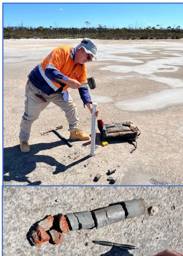
Figure 2. Lake Hope showing the push tube sampling method used to drill out the resource and an example of the lake clay from the push tube showing excellent sample recovery.

About 60% of the Measured Resource lies within West Lake, over which Impact recently pegged a Mining Lease Application (ASX Release August 12th, 2024). When required, further low-cost push-tube sampling of the lake can significantly increase the size of the measured resource (Figure 2).