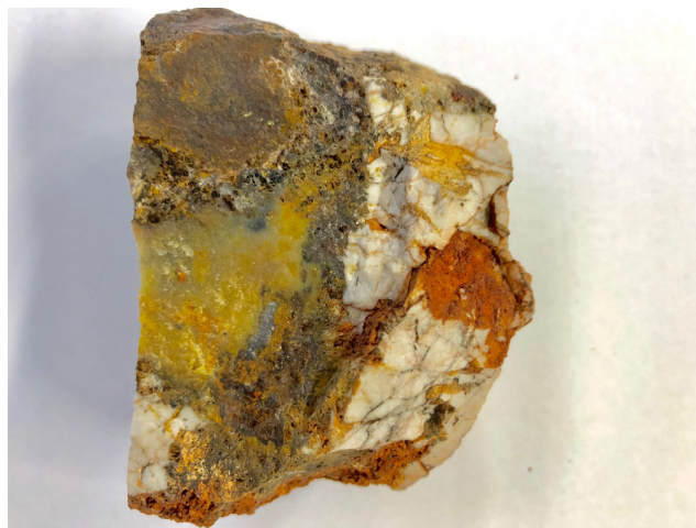
Quartz-rich limonitic breccia with abundant sulphide boxworks Specimen size 6 by 10cm (Location 89)

The subcropping gossan with prominent boxworks discovered at location 89 is from an area not investigated by gravity surveys.