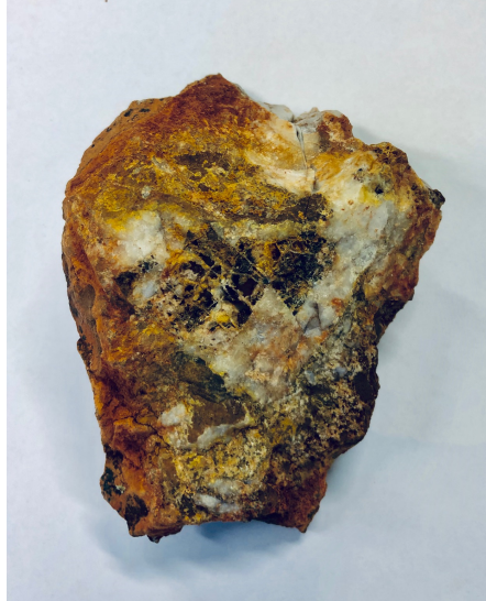
Quartz-rich limonitic breccia with coarse sulphide boxworks. Specimen size: 8 by 11cm (Location 89)