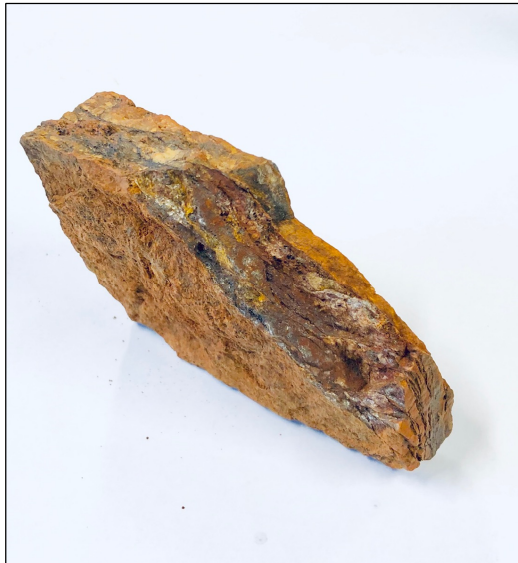
Sheared and banded sulphidic boxwork hematite –silica gossanous rock. Specimen size: 8 by 12cm (Location 101)

The sheared and banded boxwork gossan float from location 101 is from the southern zone of a major gravity anomaly as shown in Figure 1.