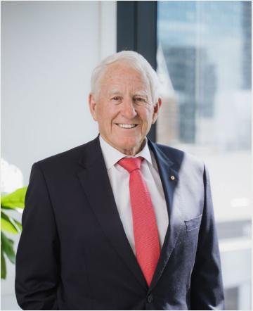
Robert Millner AO Chairman