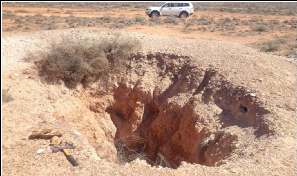
A10m deep historic shaft from which ferruginous / limonitic 'retrograde' schist was mined