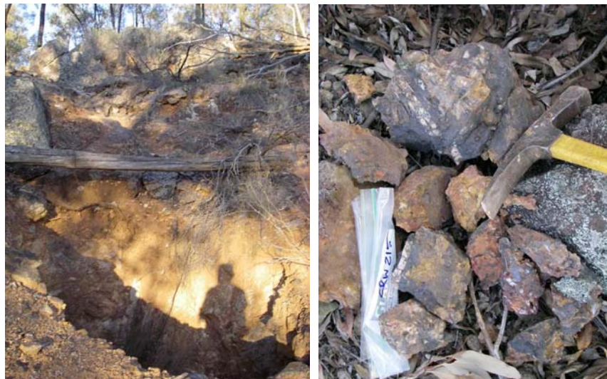
A historic mine at Crow Mountain and the silicified limonite rich mineralised rocks with quartz veins from the mine

However, in two historic gold mining districts in Peel Fault Zone, one near Barraba and the other near Bingara, only a few holes have been drilled. Crow Mountain mining district near Barraba (EL 6648) is the main focus of PMR's exploration programme in Peel Fault Zone. A series of parallel ridges extending over about 4 kilometres along strike have been identified as the main targets. In these ridges altered (pervasively silicified) limonitic volcanic rocks with quartz veins are exposed. Historic mining attempts (trenches, pits and some deeper shafts) had limited success and the hardness of the host rock for gold mineralisation was the main problem. However, with modern exploration methods like RC drilling and modern gold mining methods such hard (silicified, quartz veined) can be easily tested and exploited.