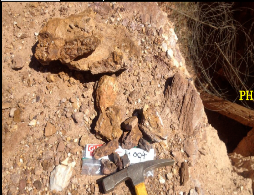
Panama Hat Mine (WP 17 – sample PH 004)