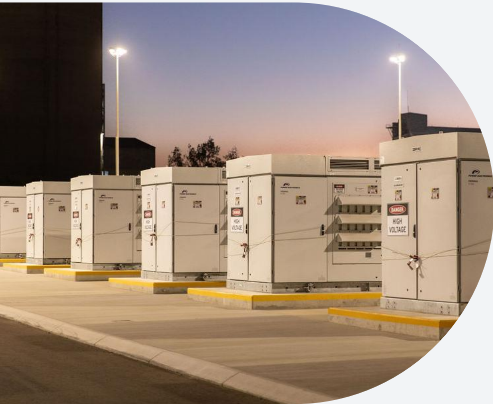
Image: Synergy's Kwinana BESS Stage 2, Western Australia