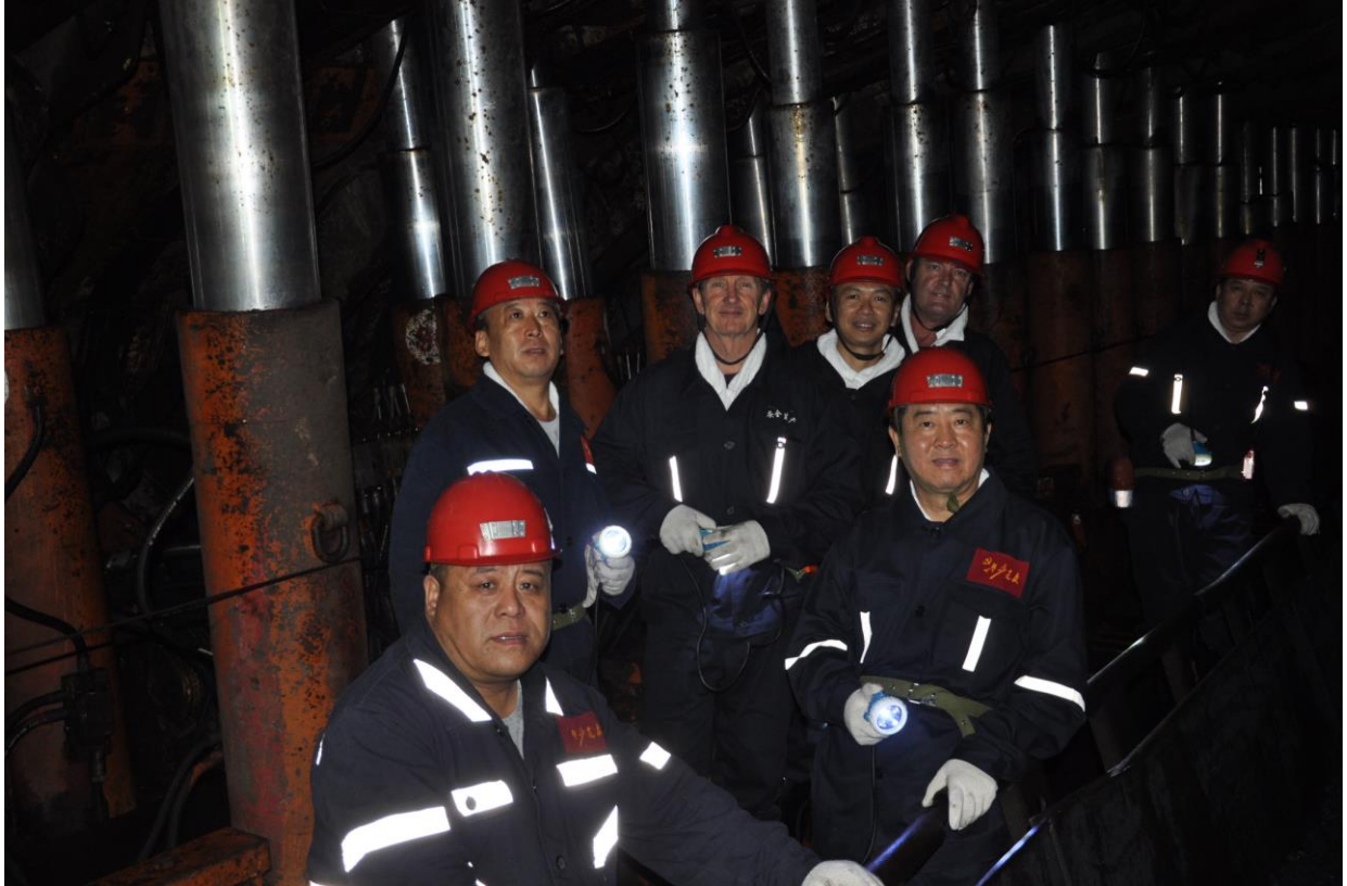
Figure 1: TCM Team underground with Longmei Executives