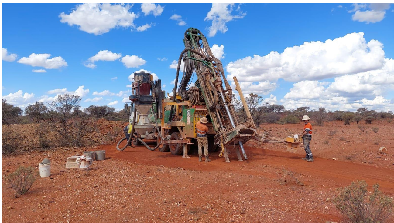
Figure 1 – RC/AC drill rig and personnel during the November 2021 Drill Programme.