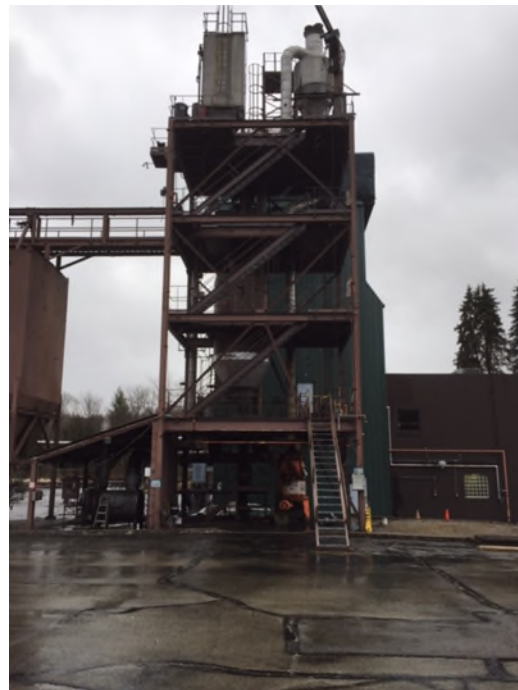
Coal pulveriser including 20 ton storage bins