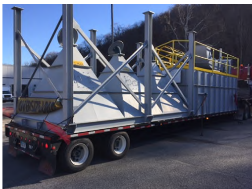
Dust collector for the 3-axis milling machine