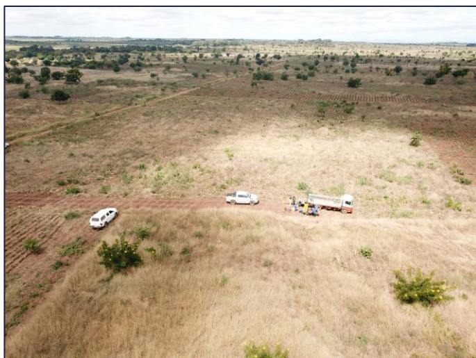
Figure 1: Test pit site prior to mining (May 2024)