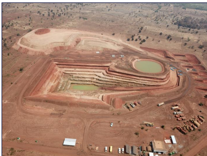
Figure 2: Test pit site mined (August 2024)