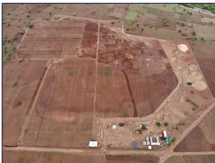
Figure 3: Rehabilitation site backfilled (December 2024)