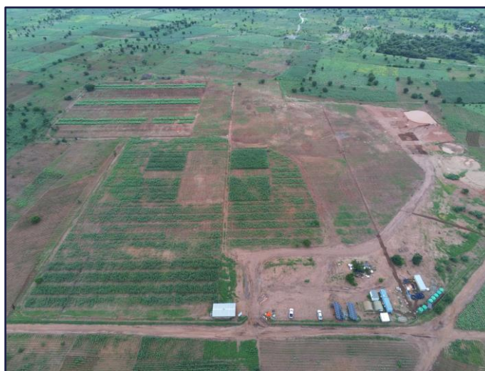
Figure 4: Rehabilitation site (February 2025)