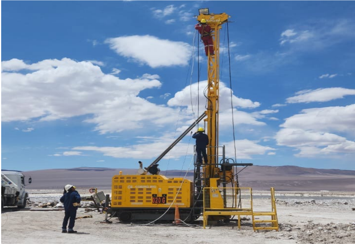
Figure 2 – DDH-1 drilling in progress

The establishment of the camp was a difficult process given the adverse weather conditions faced over the past weeks since the commencement of works with road closures and significant rain. However, despite these challenges Pursuit's local team was able to complete the setup with minimal delays.