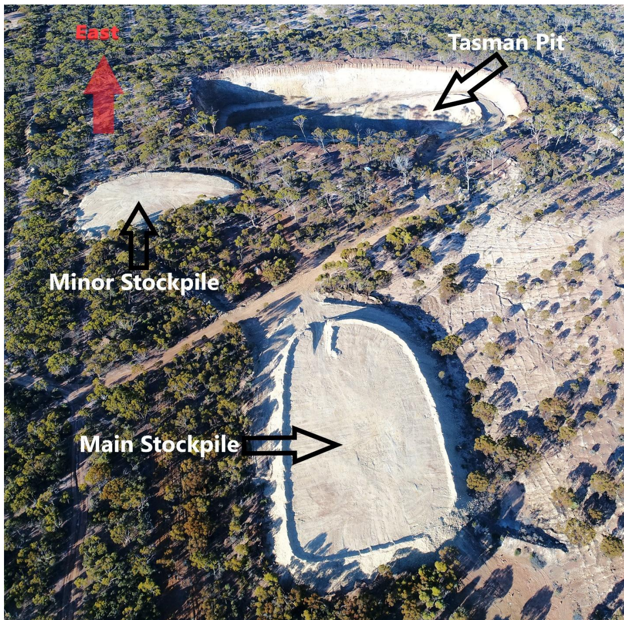
Figure 1 – Tasman Stockpiles and Pit looking East, aerial oblique view.