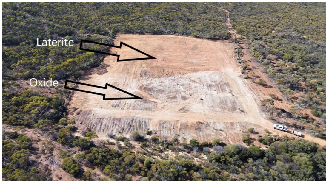
Figure 2 – Dieman Stockpiles looking East. Oblique aerial view

A mining proposal is being prepared for submission to the regulators. In addition, contractors are being engaged for the load and haulage of the stockpiles. Assessments for in-pit mining have also commenced, focusing initially on the Tasman and Dieman pit floors. Figure 3 below shows the base of the Tasman pit, which may present an early re-entry opportunity.