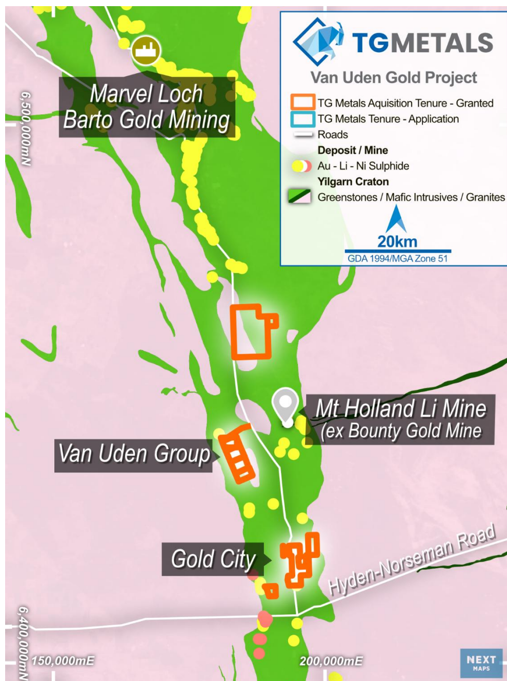
Figure 4 – Location Map showing TG Metals' Van Uden Gold Project

Van Uden Gold consists of four granted mining leases, four granted exploration licences, one exploration licence application and two miscellaneous licences (for haul roads). The Project lies to the west of the Mt Holland lithium mine, south of the operating Marvel Loch gold Plant, and southeast of the Edna May gold Plant and has a JORC 2012 compliant MRE of 6.35Mt at 1g/t Au for 227,140 oz Au, ASX announcement 5 June 2025.