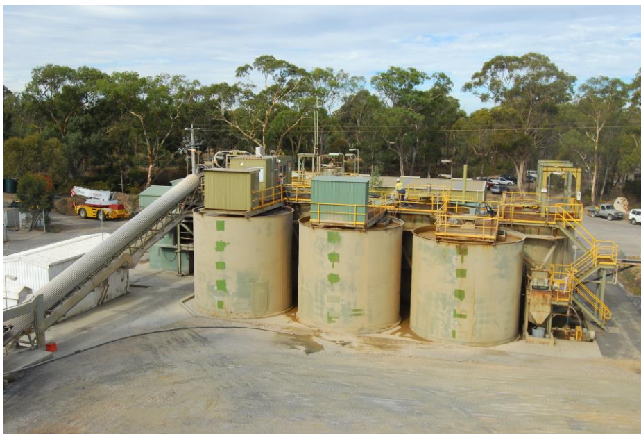
Figure 1. Operating Maldon Treatment Plant Monday 2 nd March 2015

The Company expects to complete its first gold pour in approximately three weeks' time.