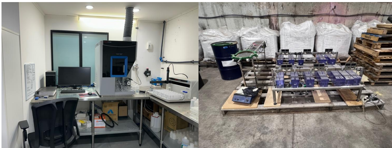
Figure 2 (L). ICP analytical machine capable of reading up to 66 elements to ppb levels of detection.