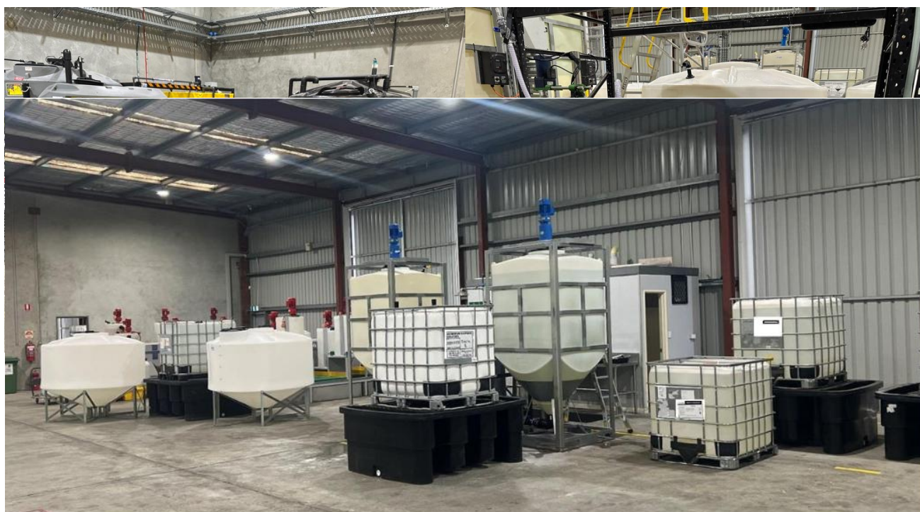
Figure 1. The HiPurA pilot plant: note the filtration units still in wrappers.