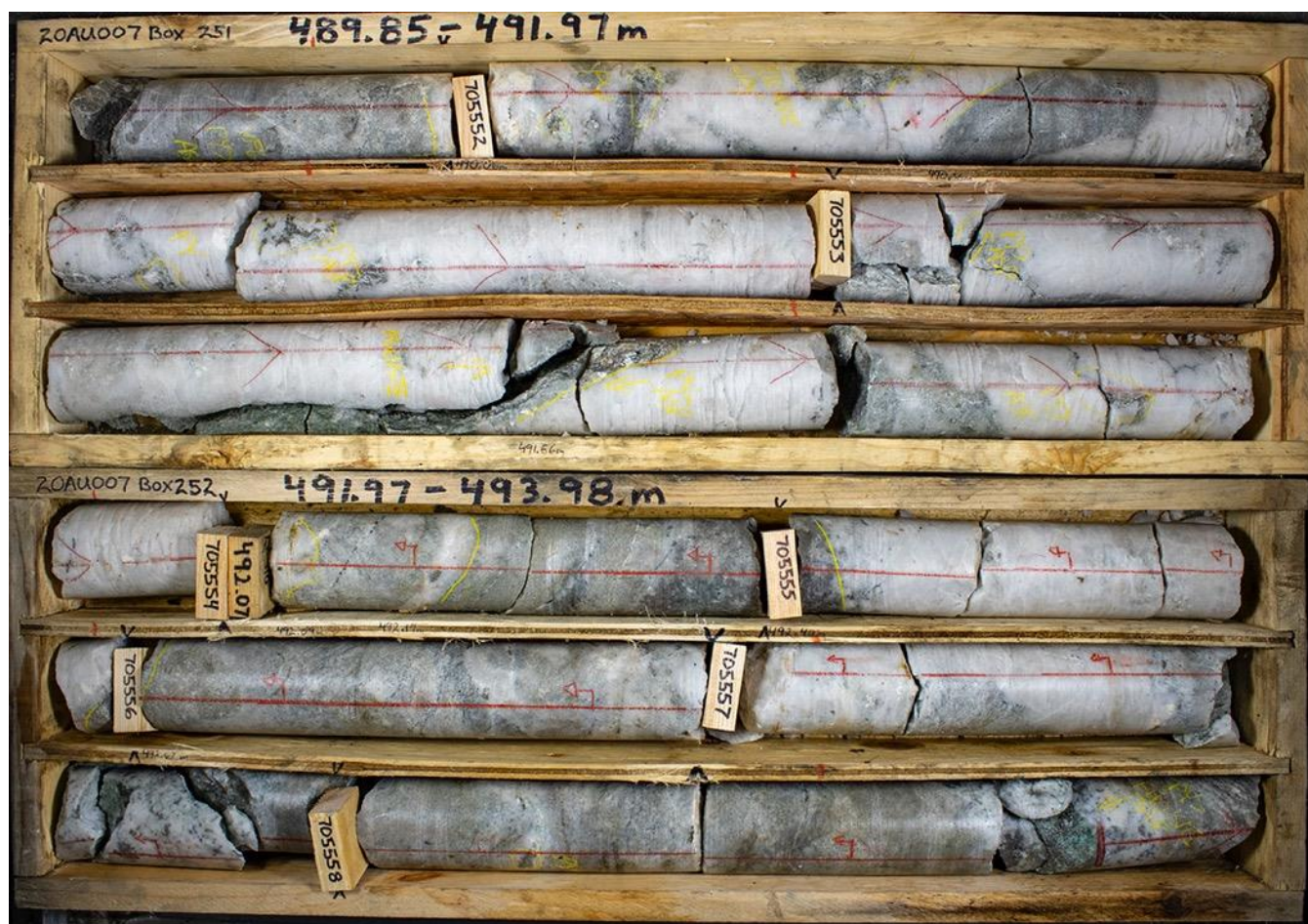
Figure 2 Hole#7 (20AU07) Quartz vein with fuchsite and sulphides - arsenopyrite, pyrite, pyrrhotite

“While the presence of gold won’t be known until the assays are returned, we know in a Pogo-style system there can be large variations in grade and vein thickness within short distances and it is important to drill more holes into this immediate area to test for grade variation, lateral extents of the vein and possible stacked sets nearby.”