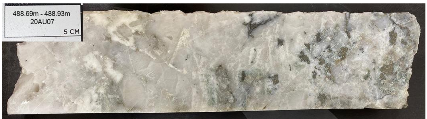
Figure 4 Hole #7 (20AU07) 488.69m - 488.93m quartz vein with fuchsite, arsenopyrite, pyrite and pyrrhotite