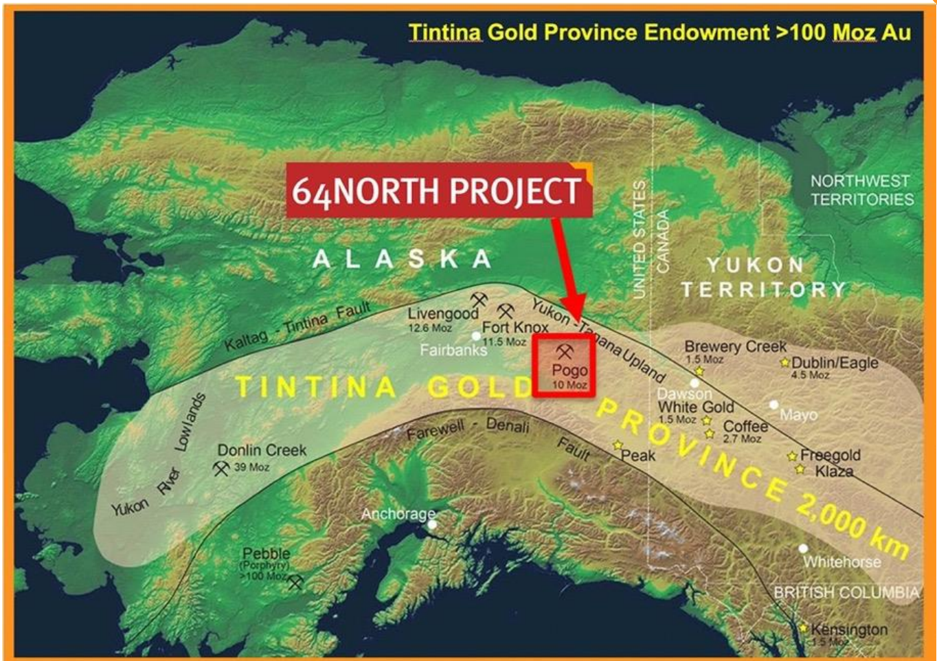
Figure 5 Deposit sizes stated as Endowment (Resources & Reserves + Historic Production) *sourced from Company websites

For further information please contact the authorising officer: