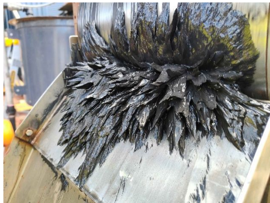
Figure 2 : Bulk LIMS photo showing magnetite concentrate.

Bulk LIMS was conducted at 1200 gauss on the composite feed material. The recovered mags were then subjected to different leach tests to extract vanadium.