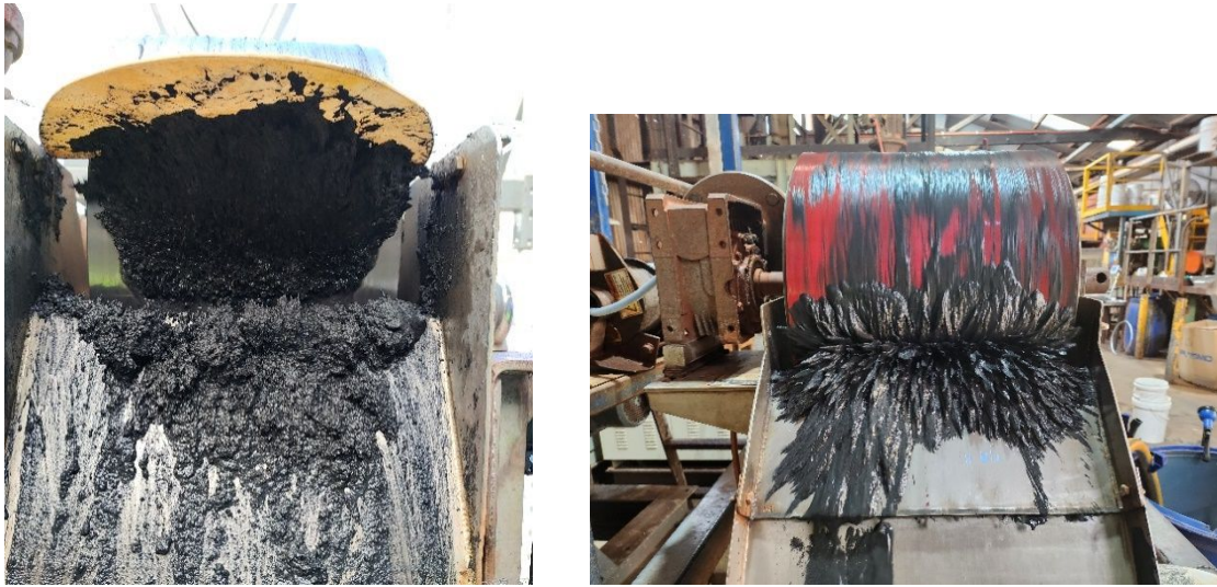
Figure 1 : Bulk MIMS photos showing magnetite concentrate.

Bulk LIMS was conducted at 900 Gauss on the composite feed material.