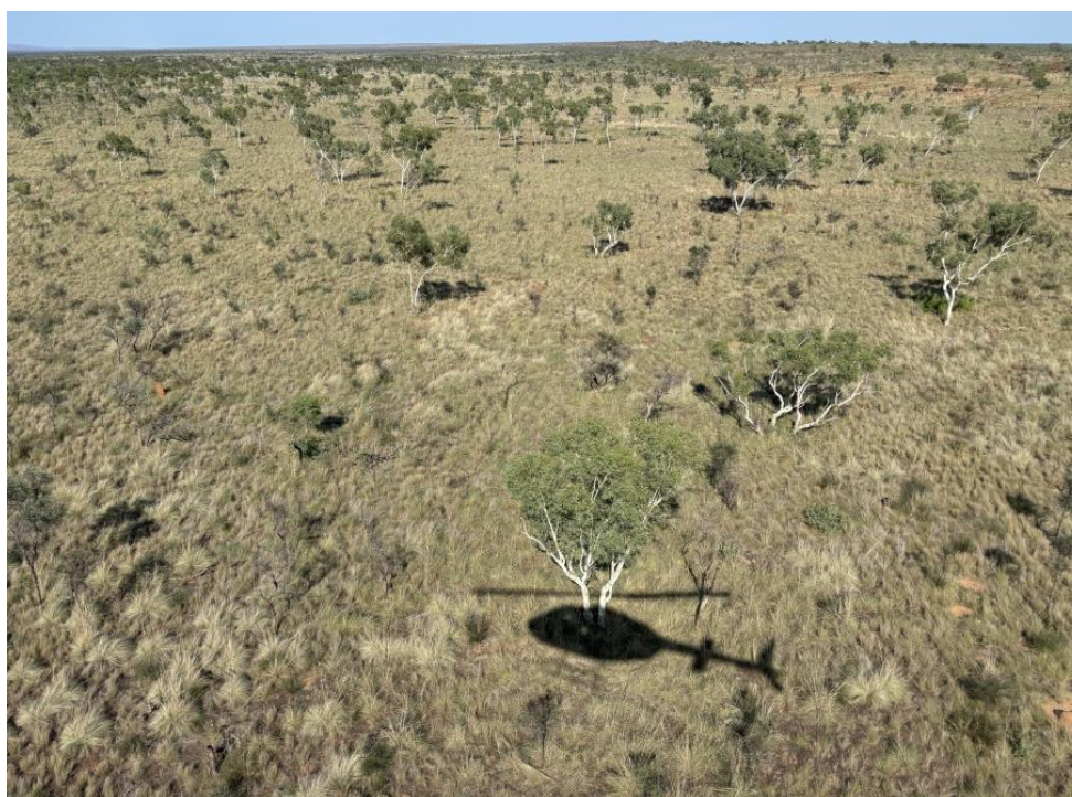
Figure 1: Biological surveys being undertaken over a potential alternative access corridor

A report with details of the findings and recommendations is expected to be issued to Northern Minerals in Q3 FY25.