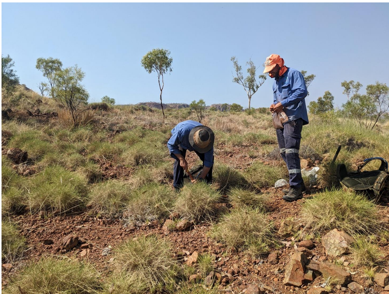
Figure 7: Field work John Galt during the IP survey

GAP Geophysics was contracted to undertake an IP Survey across the copper prospect at John Galt. The designed IP survey comprised of six lines for a total of 4,400m, of which three lines were completed for 2,300m. The aim was to test the prospect for chargeability anomalies potentially representing sub-surface copper mineralisation. Quality control, processing and interpretation of the completed IP survey was undertaken by SGC, with results due in Q3FY25.