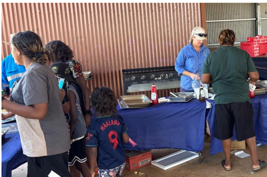
Figure 2: NTU hosting lunch at the end of school year event at Ringer Soak (Kundat Djaru)

Northern Minerals continued its program of local community engagement including supporting local events at Ringer Soak (Kundat Djaru), our closest Traditional Owner community located ~50km's from our Browns Range site. Community members were able to meet new staff members and pass on knowledge about the community and local cultural practices.