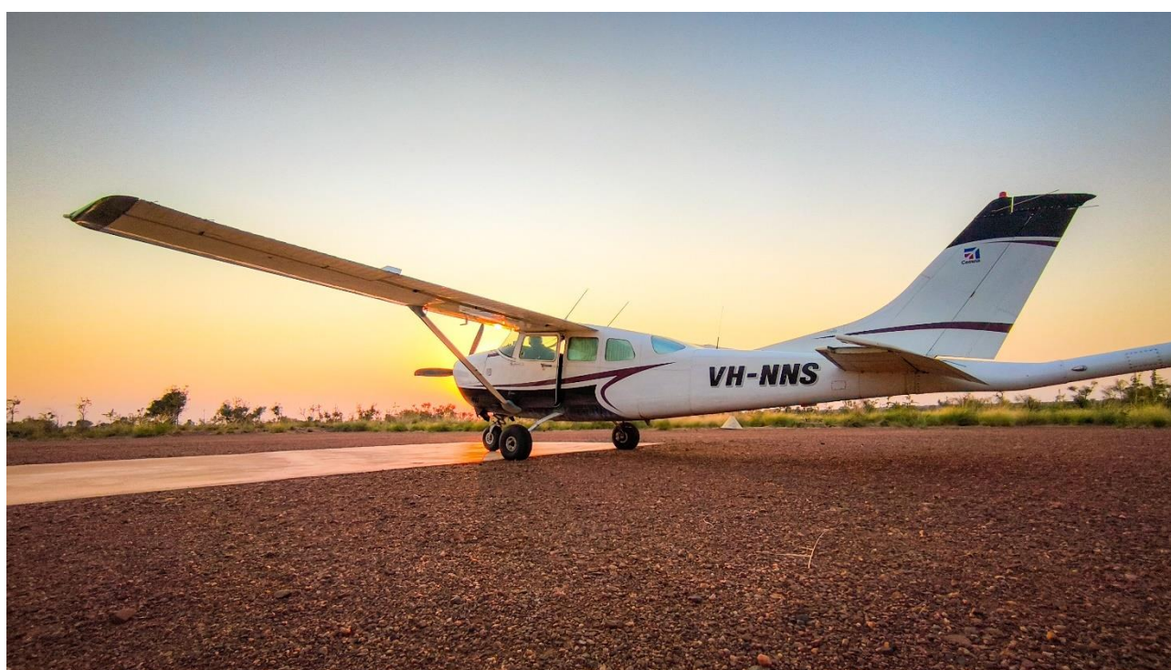
Figure 5: Airborne geophysical survey data acquisition completed over BRD-NT

Following completion of the airborne data acquisition, geophysical image processing was completed by SGC. Geophysical image data is under assessment for exploration potential, with priority areas to be defined for initial detailed litho-structural interpretation and targeting.