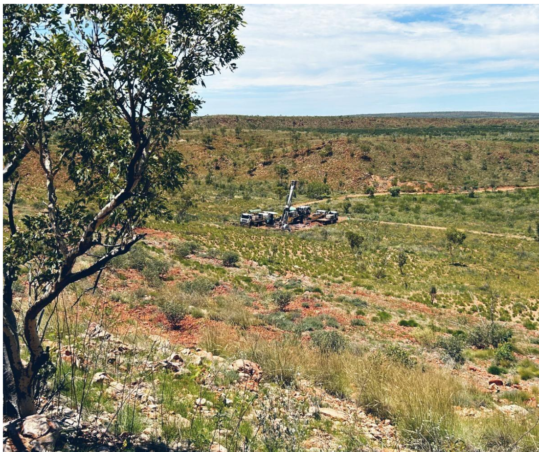
Figure 4: Drilling underway at Dazzler Deposit in January 2025

Detailed assessment of geophysical data was carried out to target interpreted regional structures below the geological unconformity between the overlying Gardiner sedimentary units and the underlying Browns Range metamorphics as potential structural conduits for hydrothermal mineralising systems.