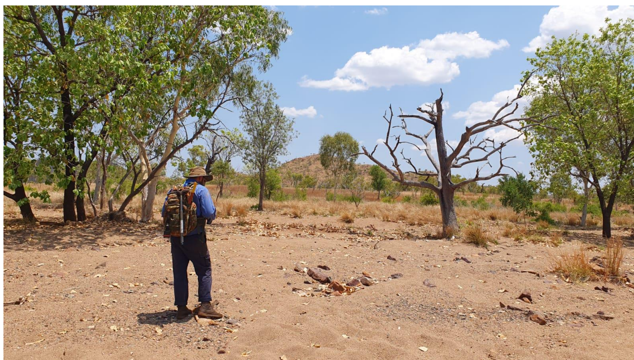
Figure 6: Field reconnaissance work at the John Galt copper prospect

Four stream sediment samples were collected during the orientation sampling program. Although this is very limited dataset, the location of these is proximal to known HREE and Cu occurrences. Analysis will be performed to assess the effectiveness of finer fraction soils against existing bulk methods for potential use in more regional sampling programs.