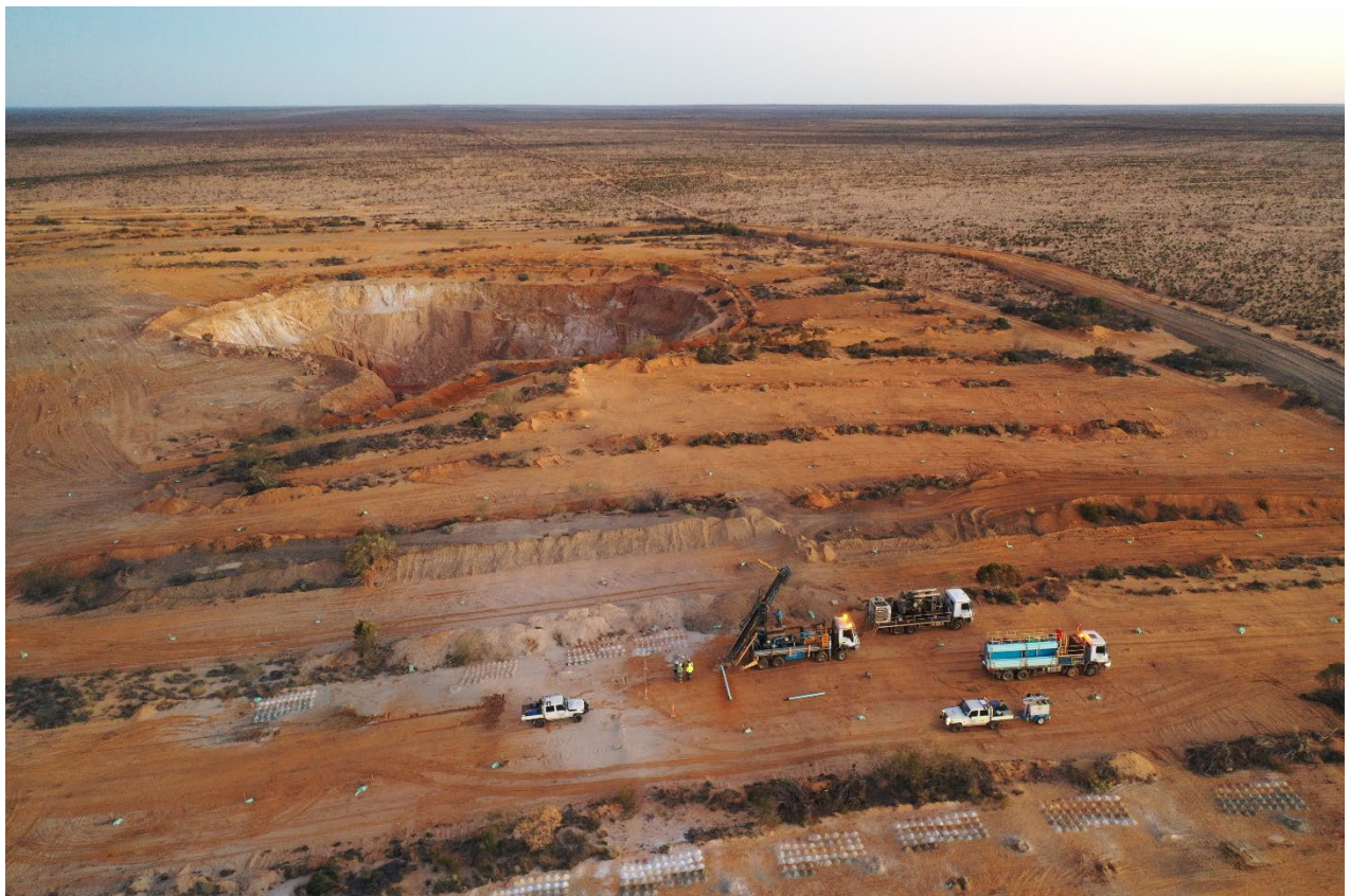
Figure 1: Drill Rig spinning at Iguana, with the Jamaican Rock Pit seen in background