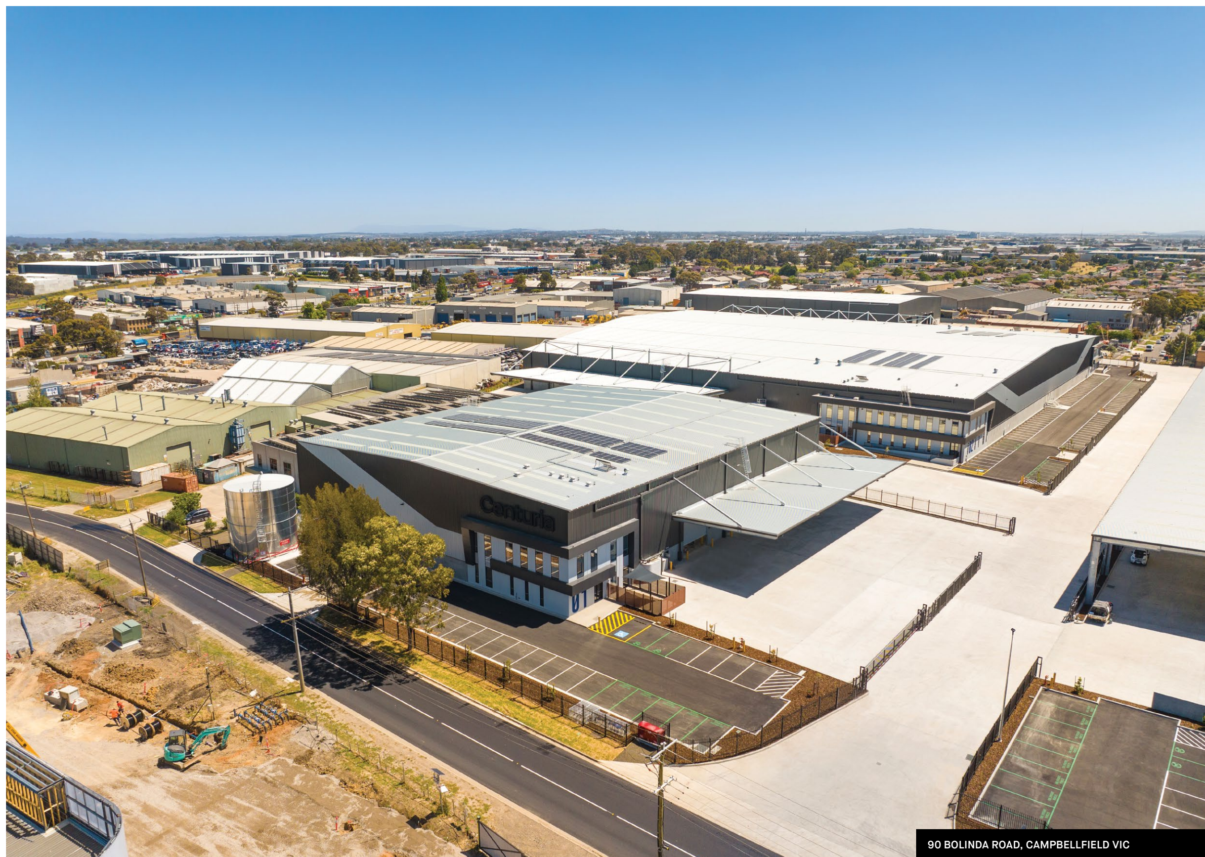
90 BOLINDA ROAD, CAMPBELLFIELD VIC

Further details of the Group's sustainability risk management approach and initiatives are outlined in the Centuria Environmental, Social and Governance (ESG) Policy and Sustainability Report, which is updated annually and published. The Centuria ESG Policy is available at centuria.com.au/centuria-capital/corporate/governance and the Sustainability Report is available at centuria.com.au/centuria-capital/corporate/sustainability .