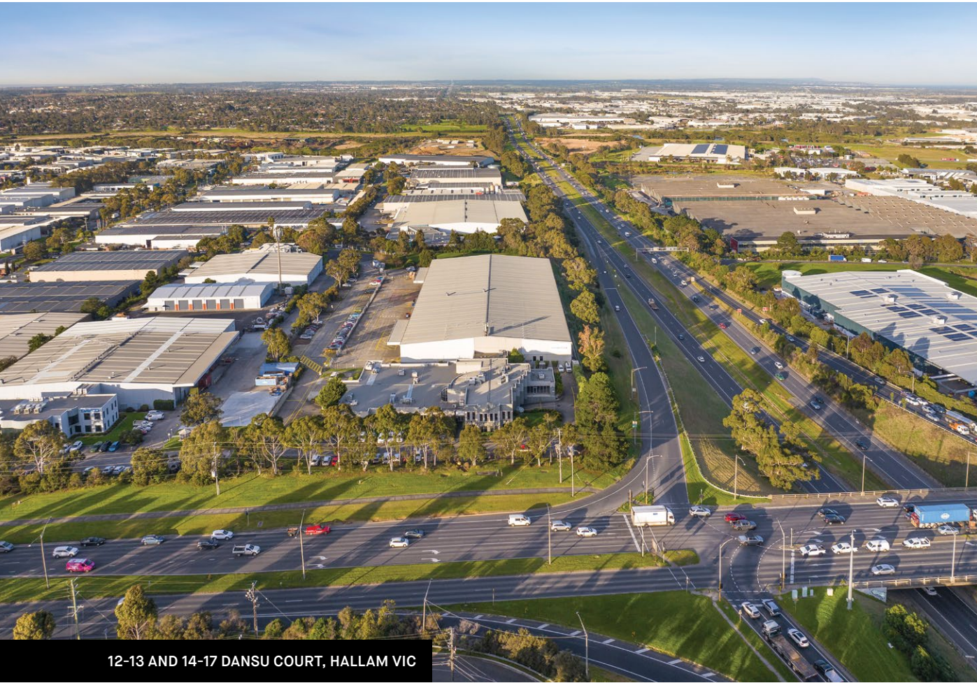
12-13 AND 14-17 DANSU COURT, HALLAM VIC

In addition to the skills and experience set out on the following page, the CPF2L Board comprises Directors with diverse backgrounds and an appropriate balance of Directors with strong corporate memory and those that bring an external or fresh perspective.