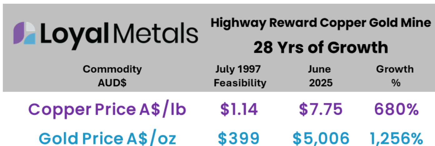
Graph 1: Highway Reward Copper Gold Mine – mining ceased in July 2005: 28 Years of Commodity Growth

With the growth in commodity prices and advancements in exploration and mining technologies, the potential for remnant copper-gold mining has significantly improved. Previous mining operations targeted copper within chalcopyrite, while gold associated with both chalcopyrite and pyrite was excluded from the mine plan. With lower copper equivalent cut-off grades (copper & gold), higher continuity of copper-gold can be drill tested to demonstrate the reasonable prospects for eventual economic extraction and mineral resource potential.