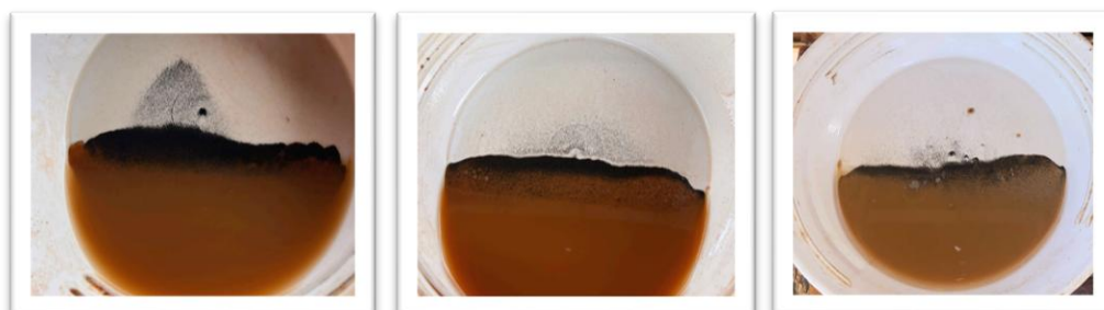
Figure 1: HM in drillholes - Left Image MM01, central image MM06, right image MM57